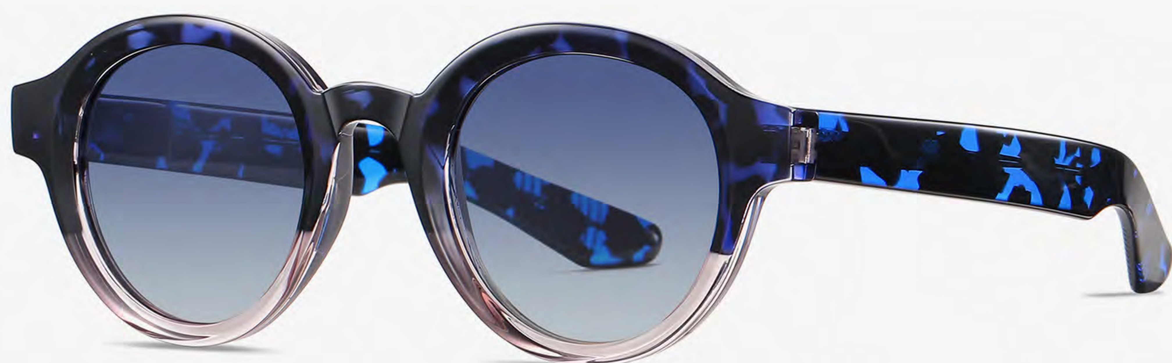
N0.4 Blue Demi Floral - Grey Blue C4 (1.1polarized light)