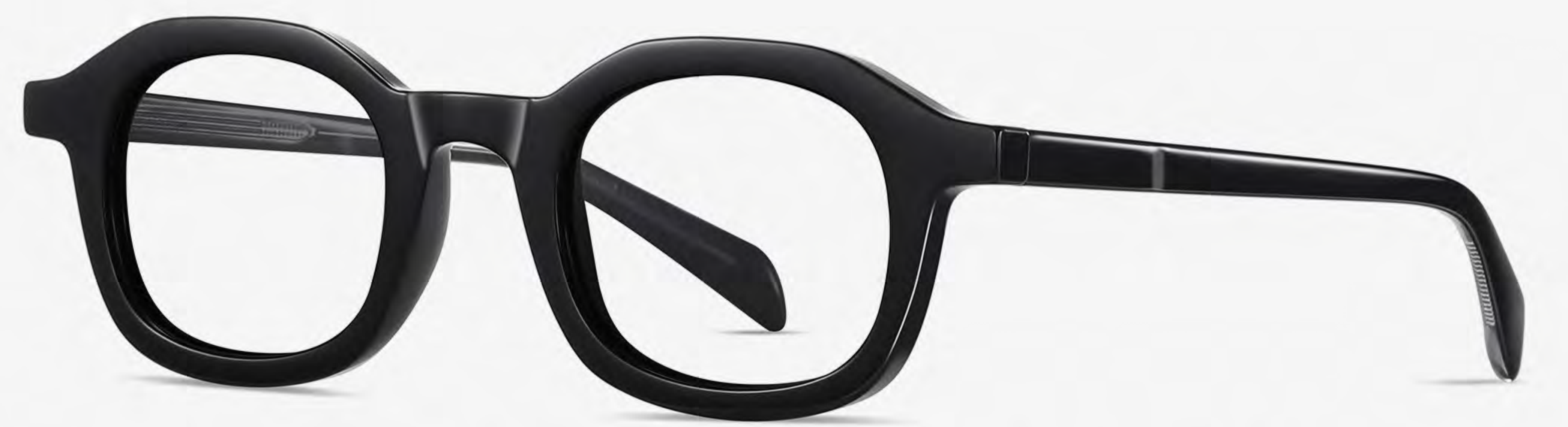
N0.5 Bright Black C1-1 (Anti blue light)