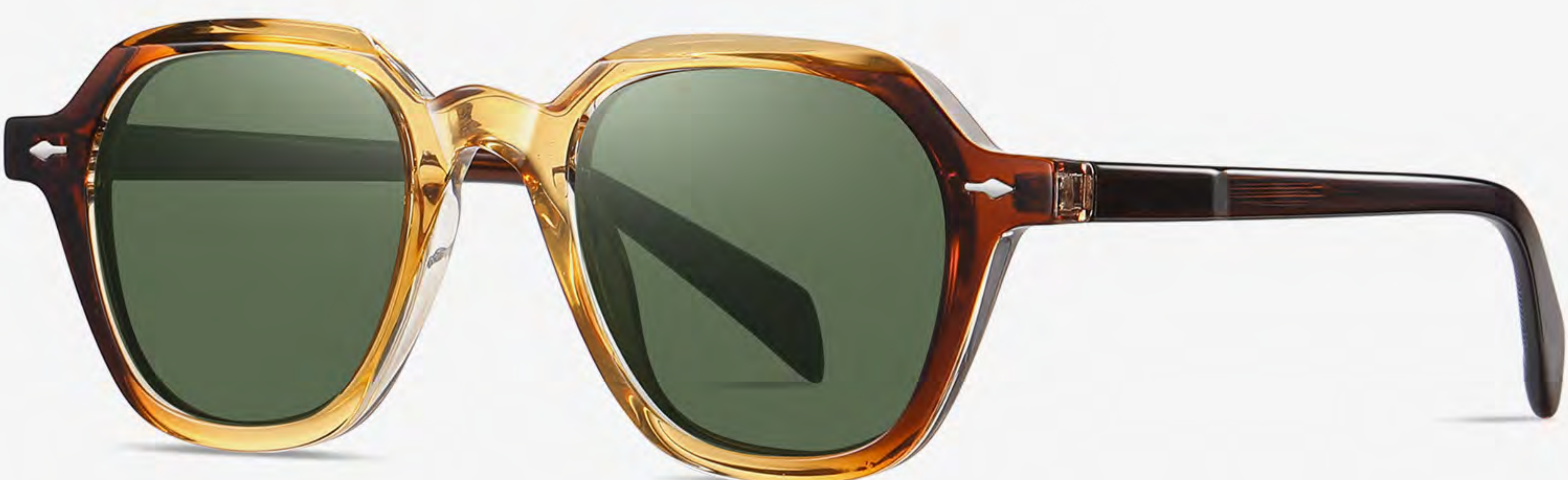
N0.3 Deep Brown Green C3 (1.1polarized light)