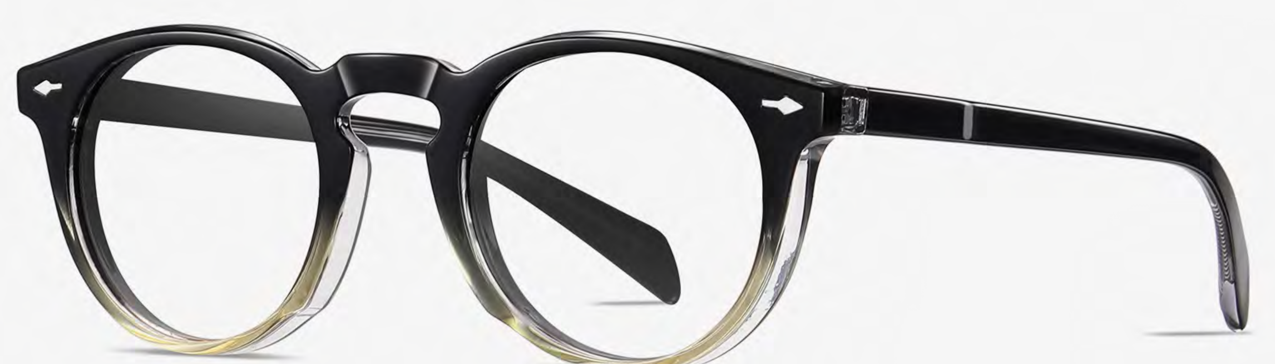
N0.8 Black - Creamy C4-1 (Anti blue light)