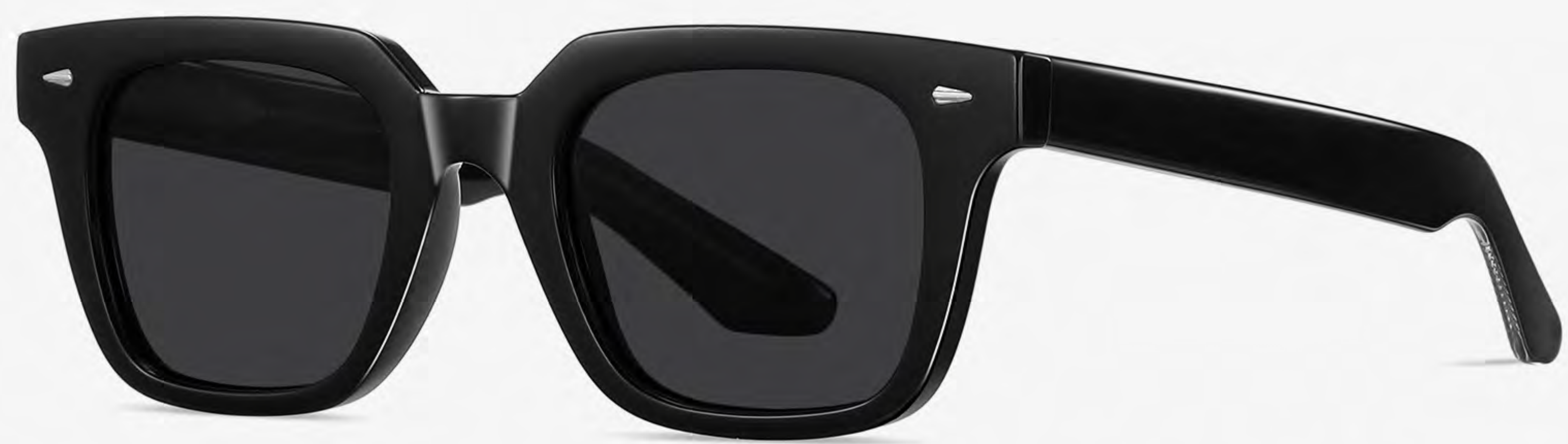
N0.1 Bright Black Grey C1 (1.1polarized light)