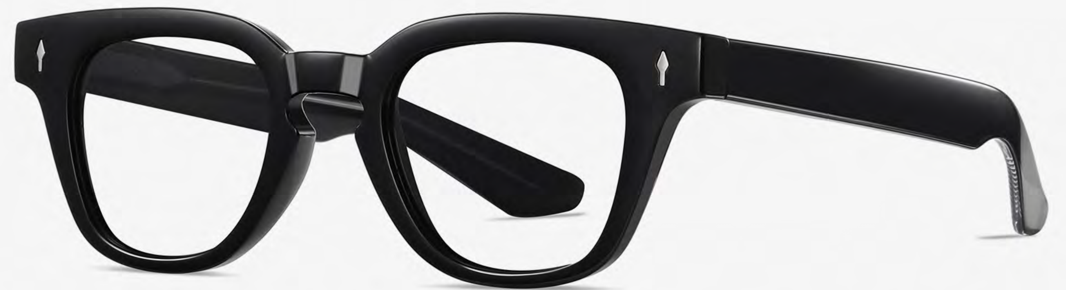
N0.5 Bright Black C1-1 (Anti blue light)