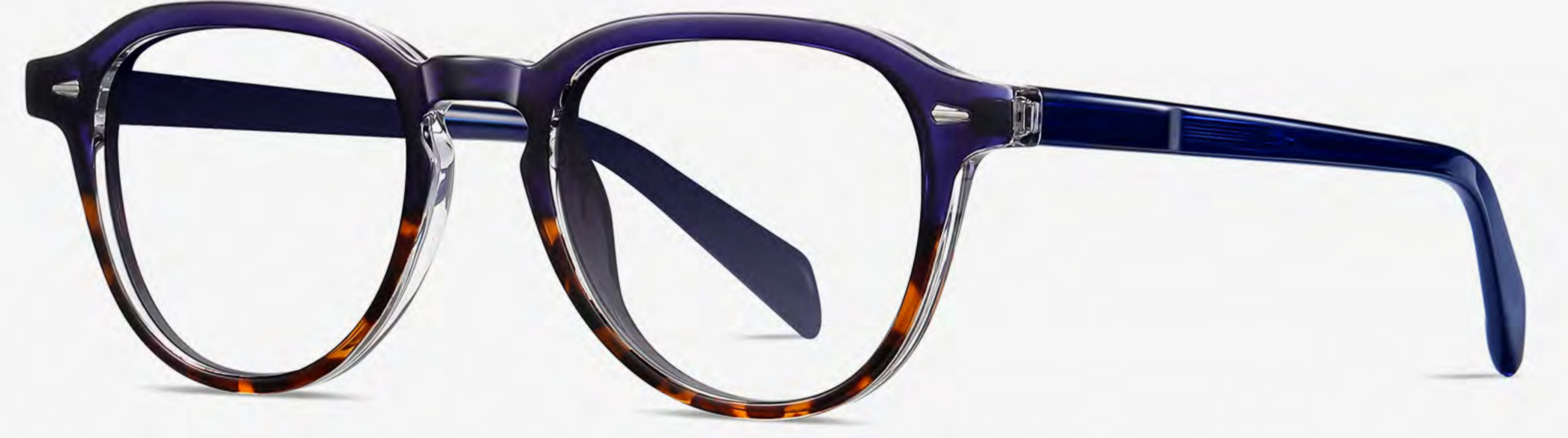
N0.7 Blue - Demi Floral C3-1 (Anti blue light)