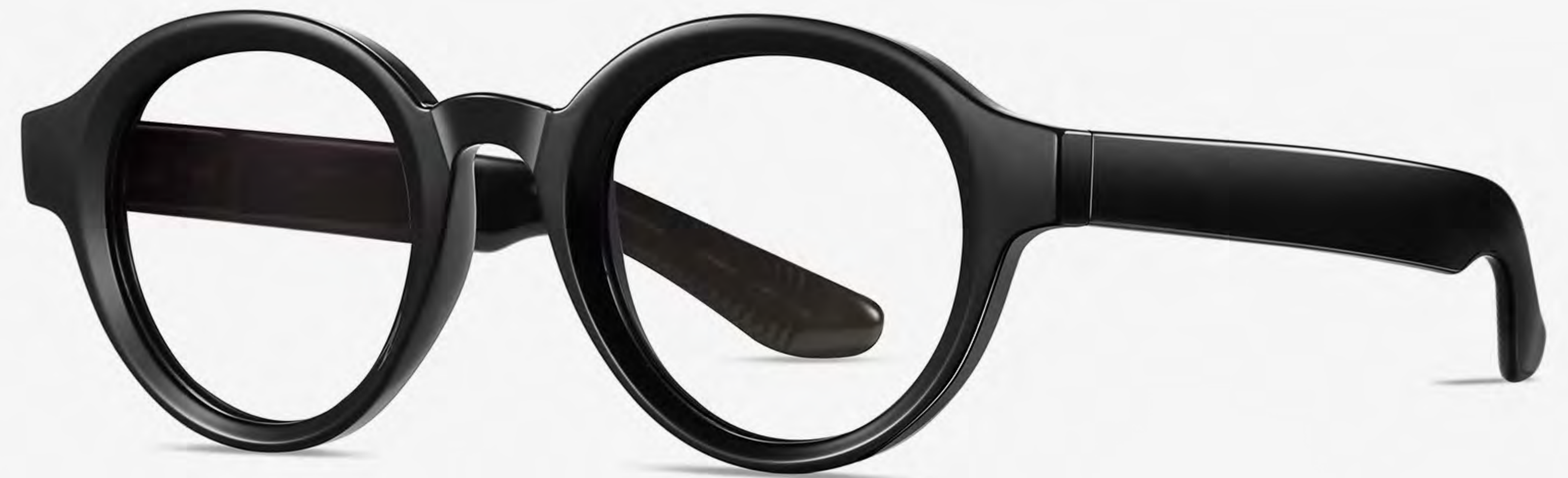
N0.6 Bright Black - Demi Floral C2-1 (Anti blue light)