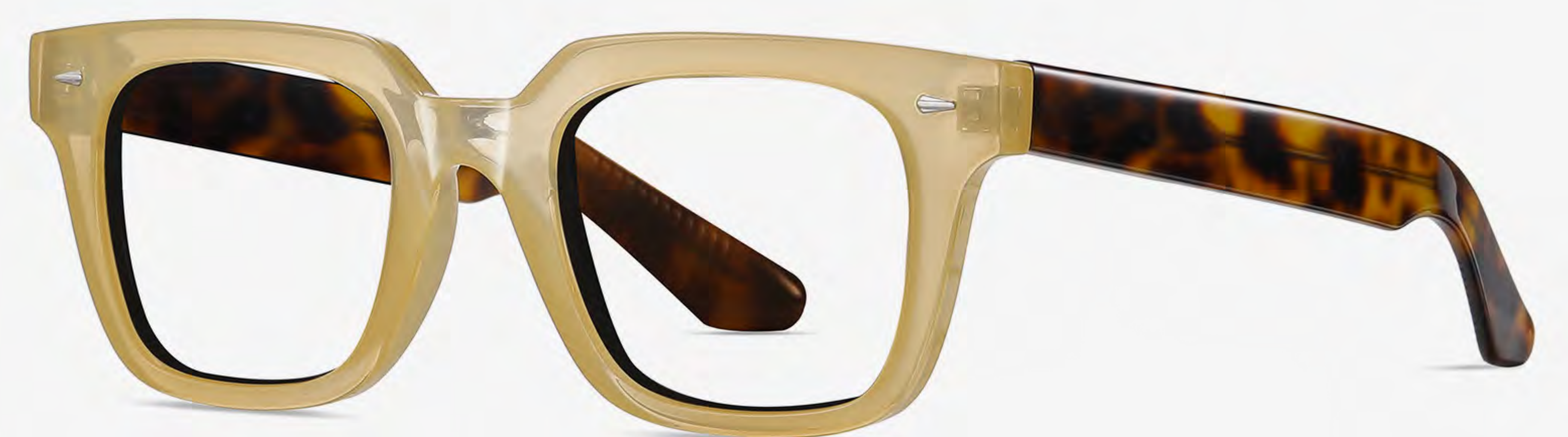
N0.6 Creamy Yellow C2-1 (Anti blue light)