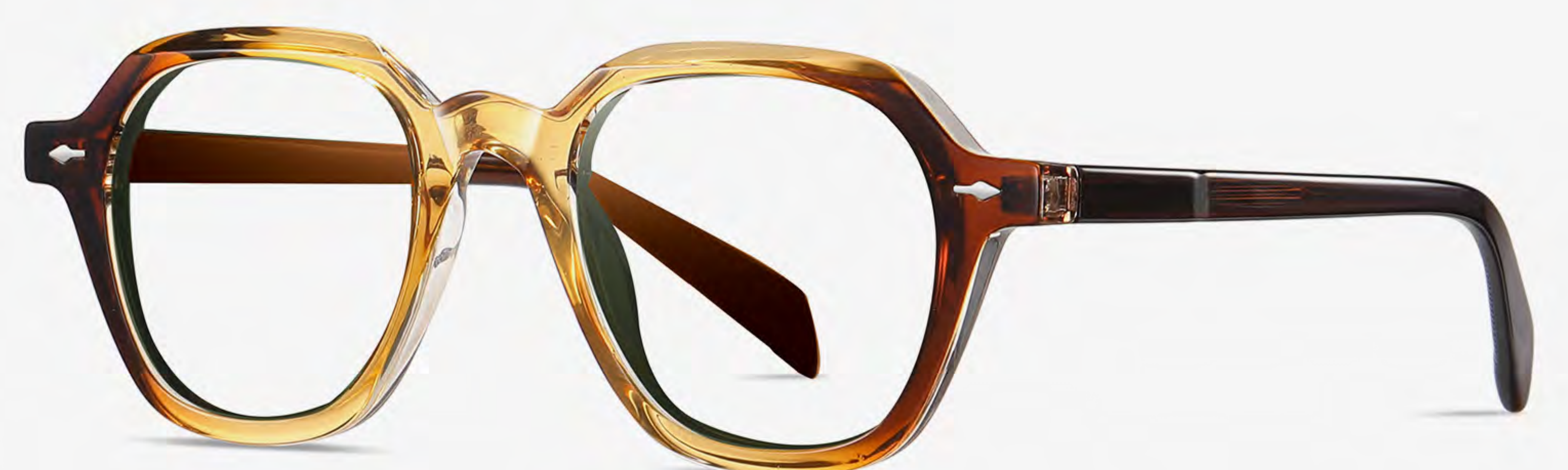
N0.7 Deep Brown C3-1 (Anti blue light)