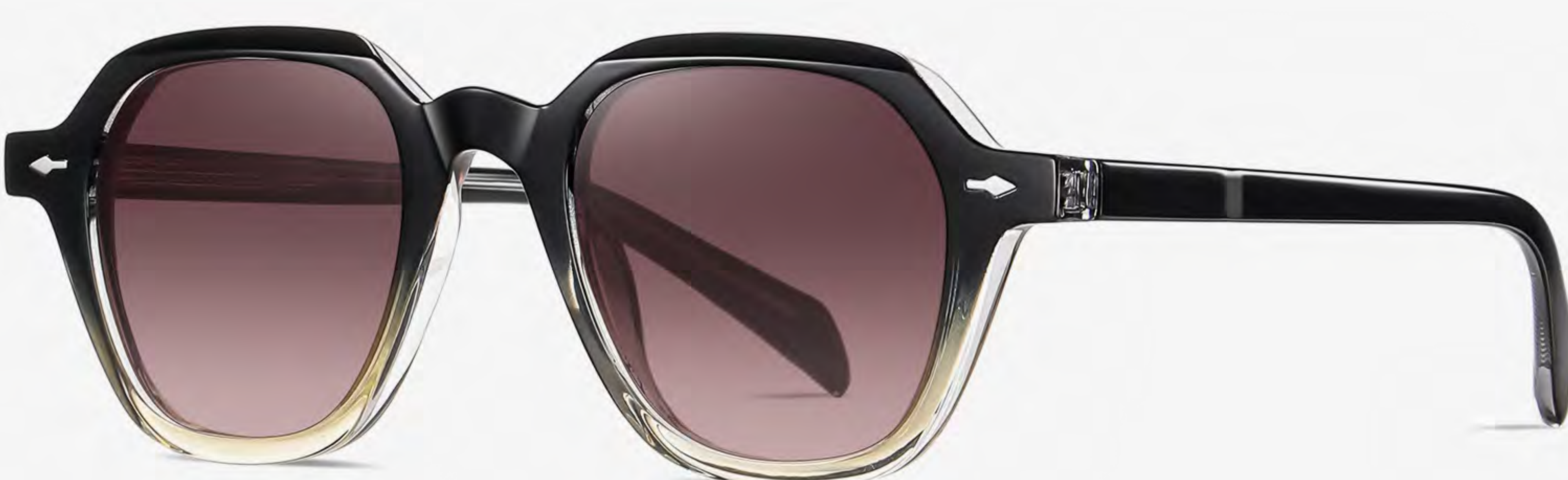
N0.4 Black - Creamy Tea C4 (1.1polarized light)