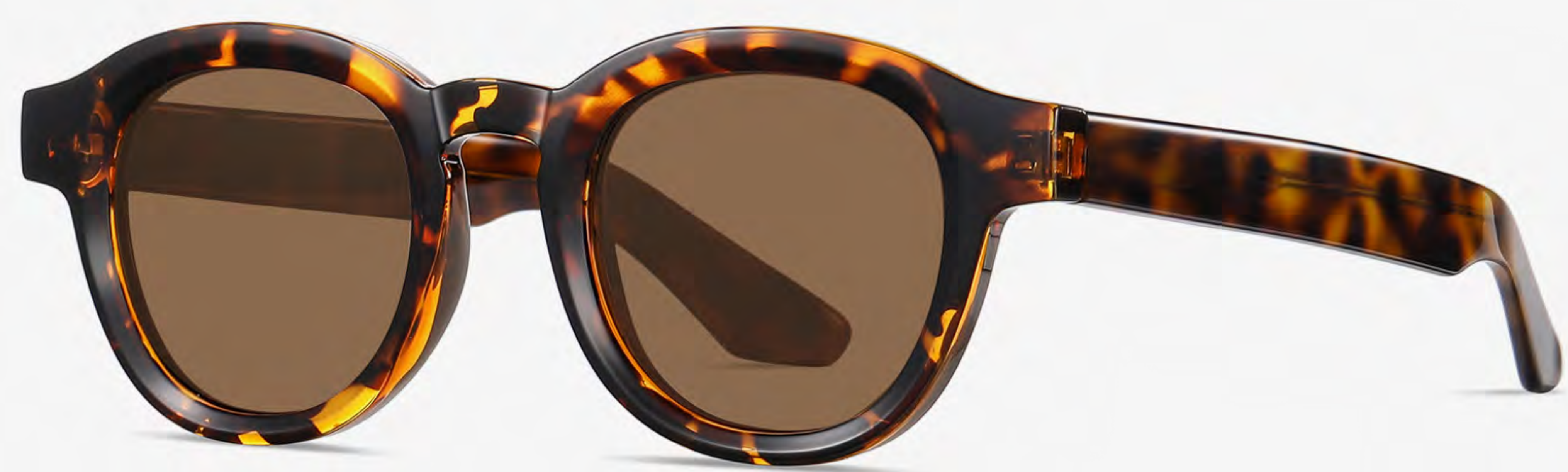
N0.2 Tortoiseshell Tea C2 (1.1polarized light)