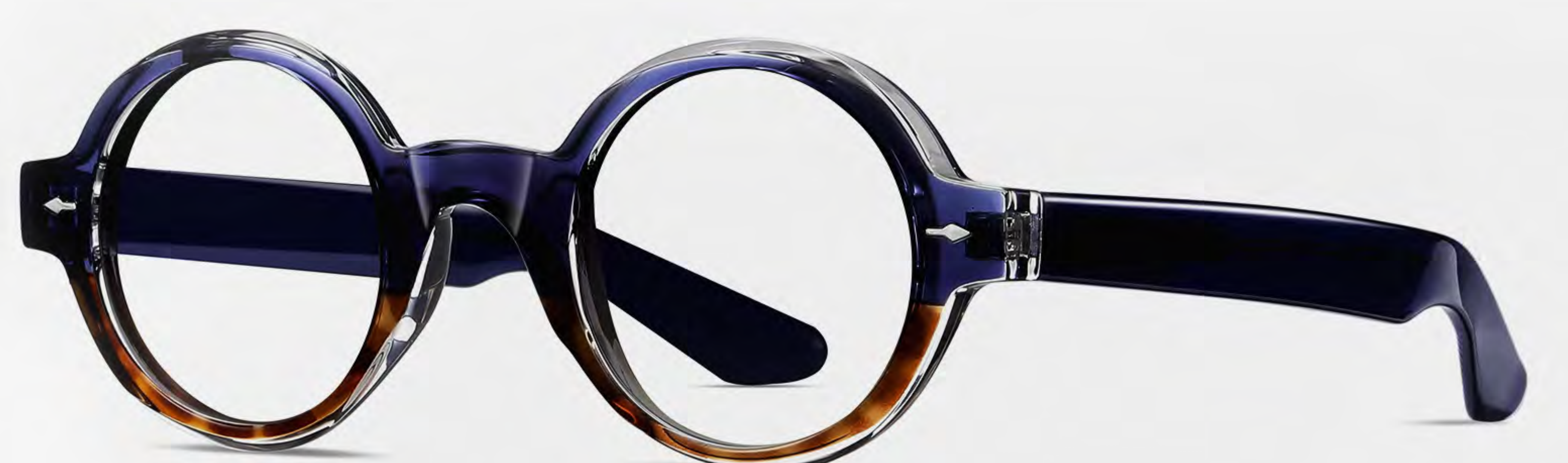
N0.8 Blue - Demi Floral C4-1 (Anti blue light)