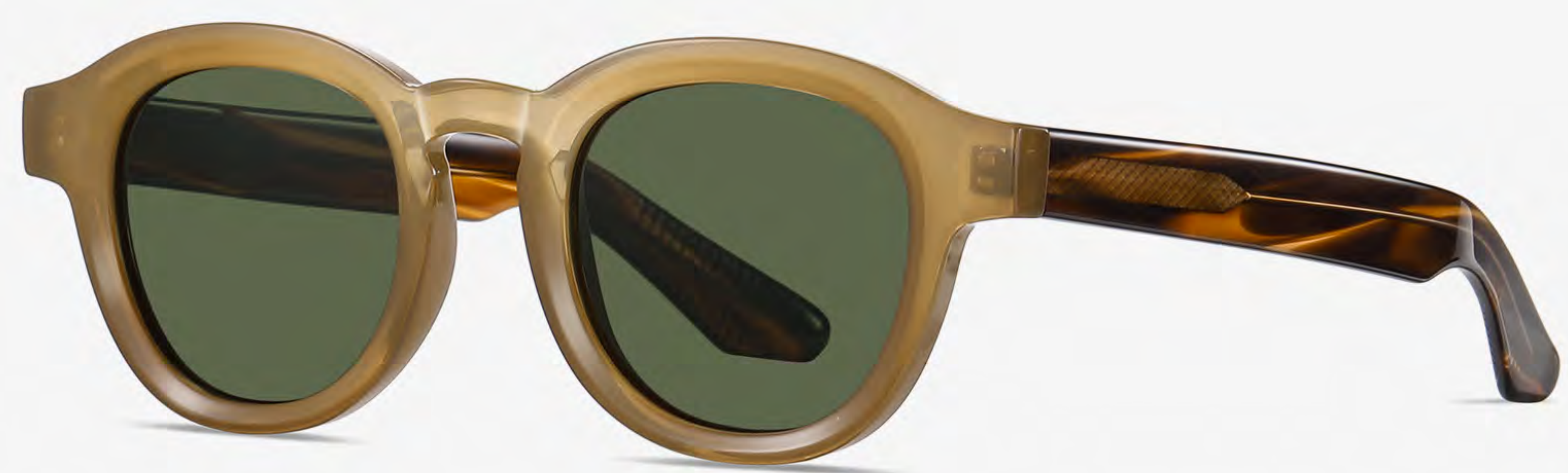
N0.3 Deep Brown Green C3 (1.1polarized light)