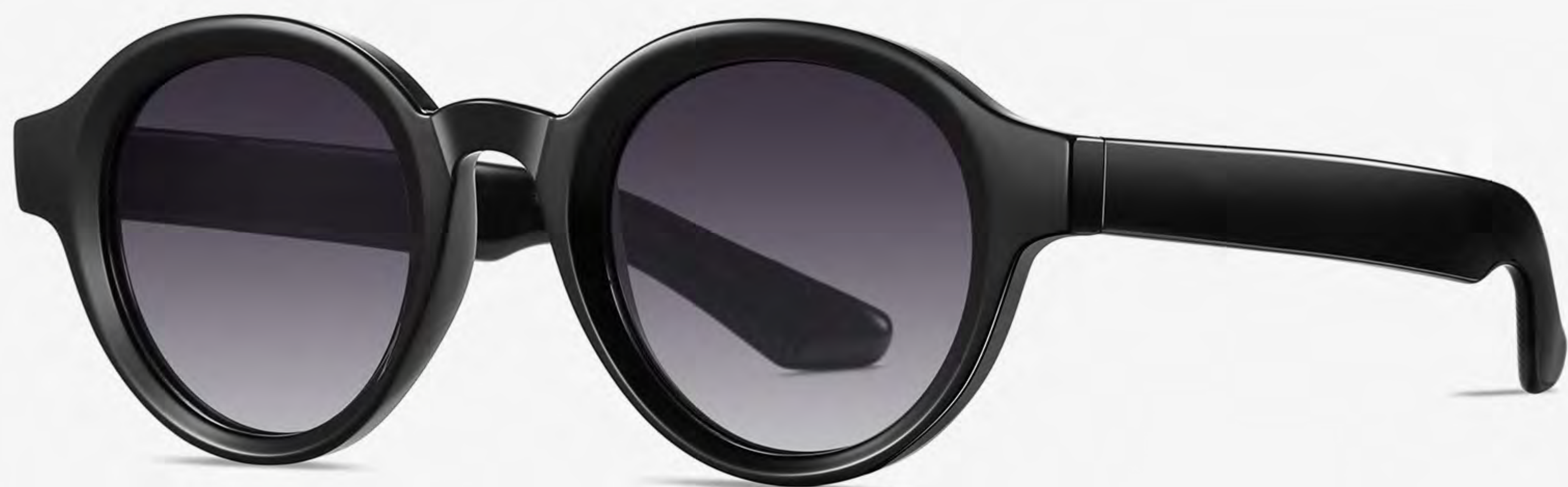
N0.2 Bright Black - Demi Floral Grey C2 (1.1polarized light)