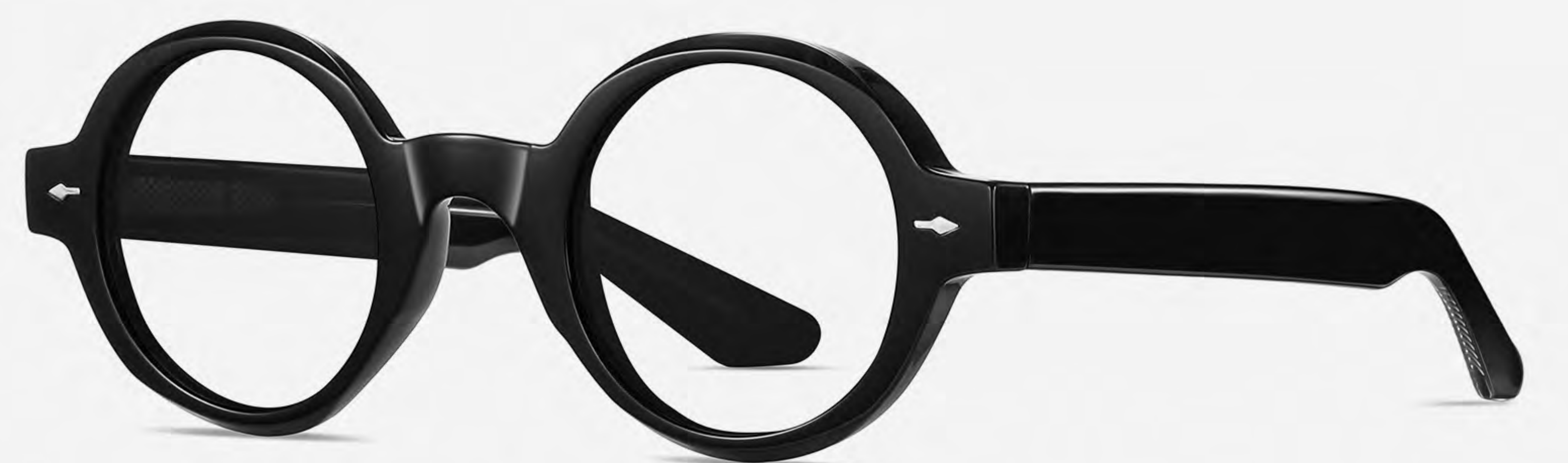
N0.5 Bright Black C1-1 (Anti blue light)