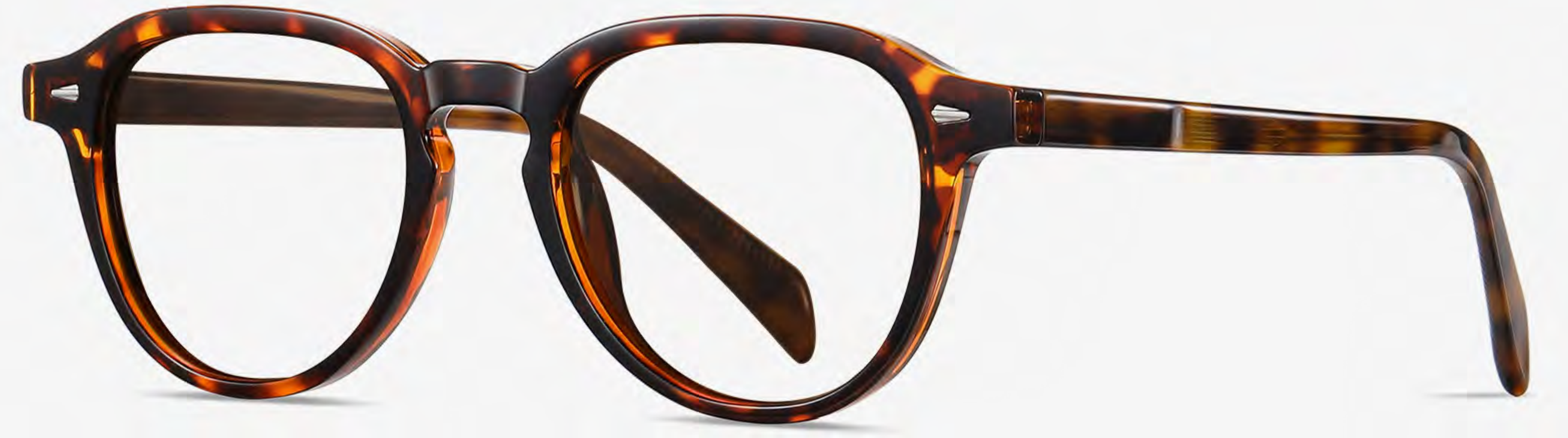
N0.6 Demi Floral C2-1 (Anti blue light)