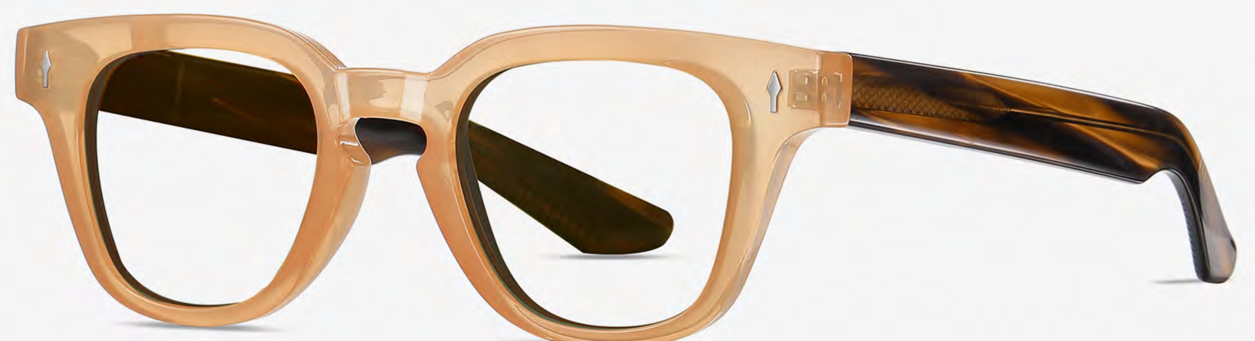
N0.7 Bright Orange C3-1 (Anti blue light)