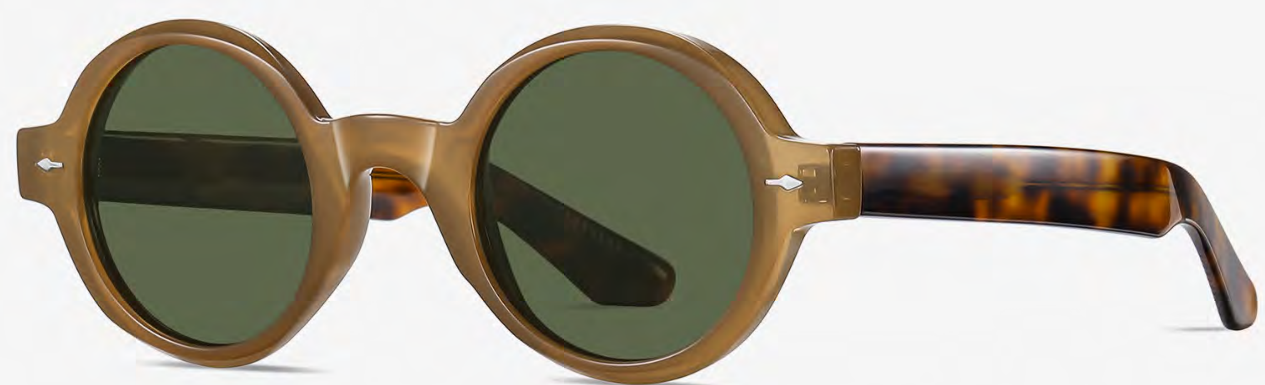
N0.3 Deep Brown Green C3 (1.1polarized light)