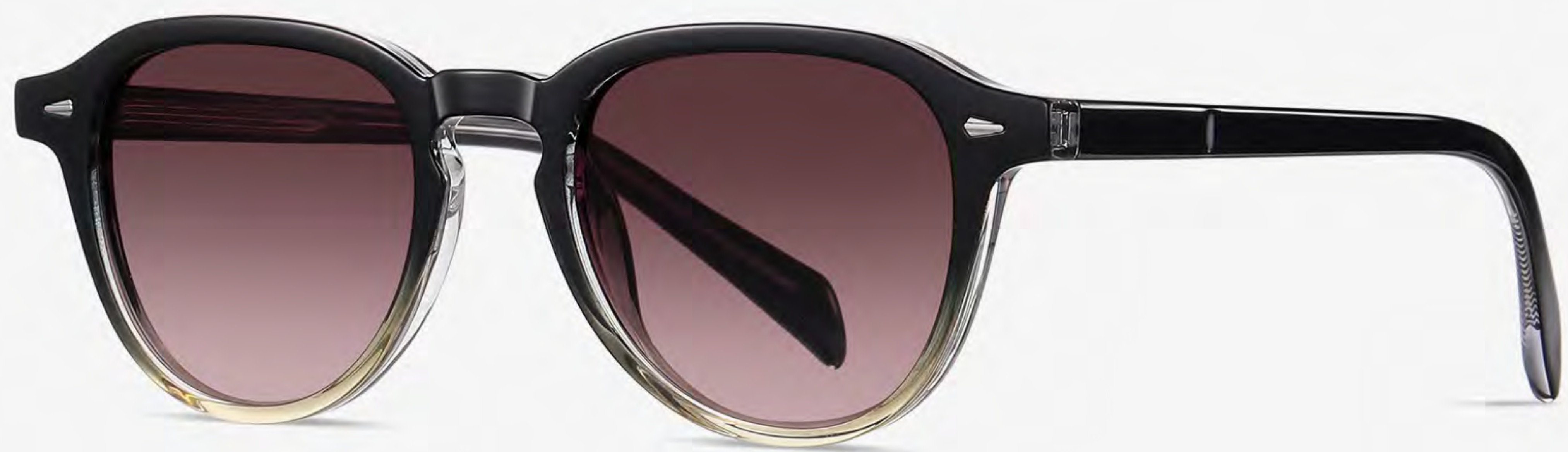
N0.4 Black - Green Tea C4 (1.1polarized light)