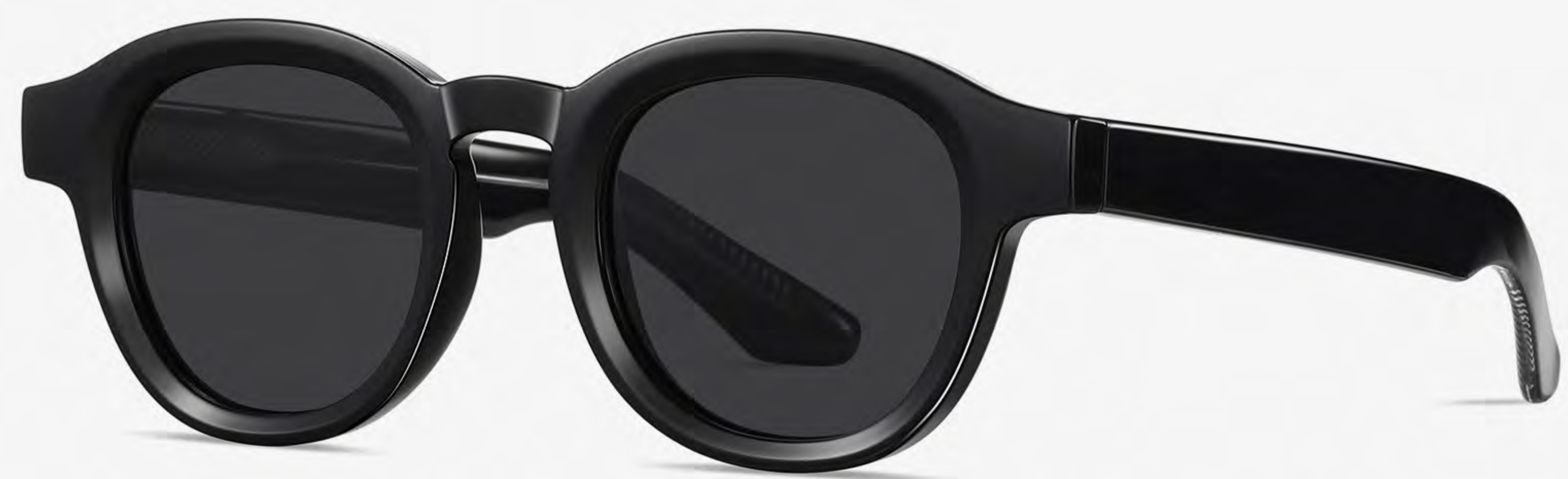
N0.1 Bright Black Grey C1 (1.1polarized light)