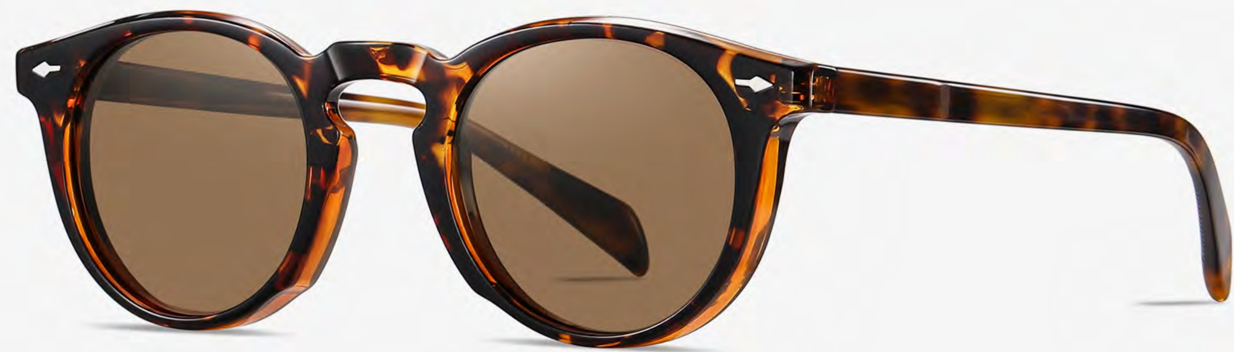
N0.2 Demi Floral Tea C2 (1.1polarized light)