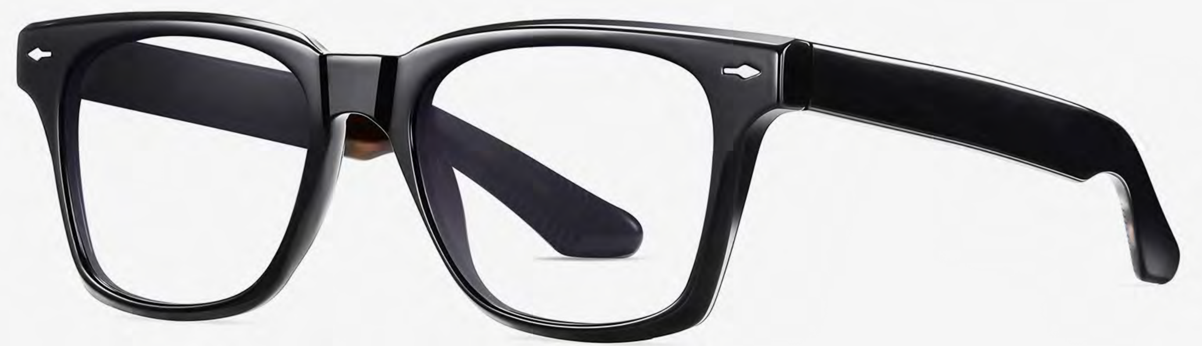
N0.6 Black Demi Floral C2-1 (Anti blue light)