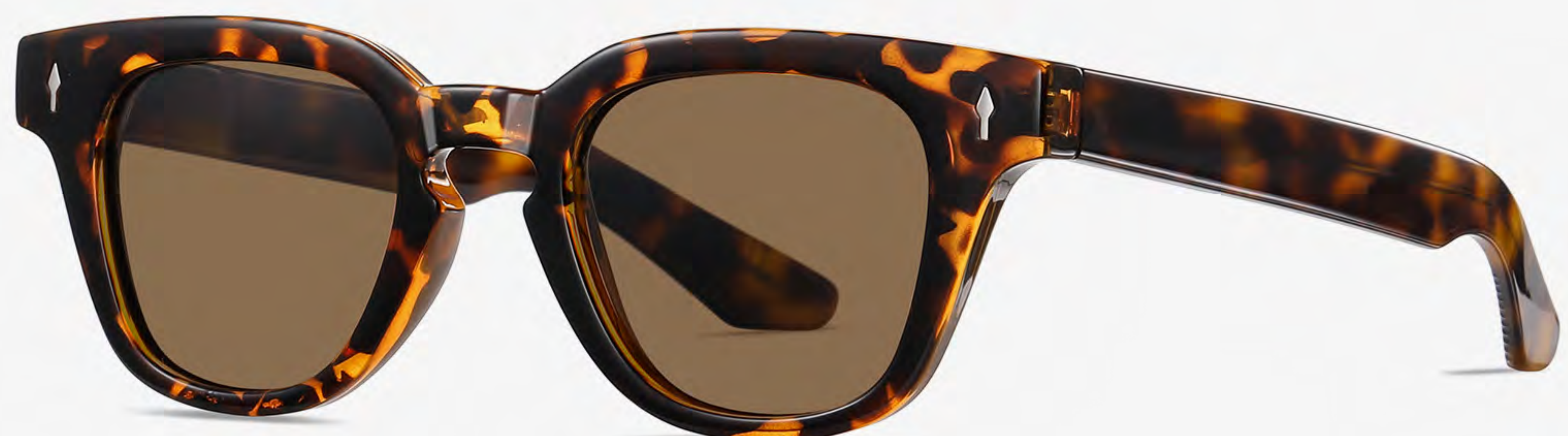
N0.2 Demi Floral Tea C2 (1.1polarized light)