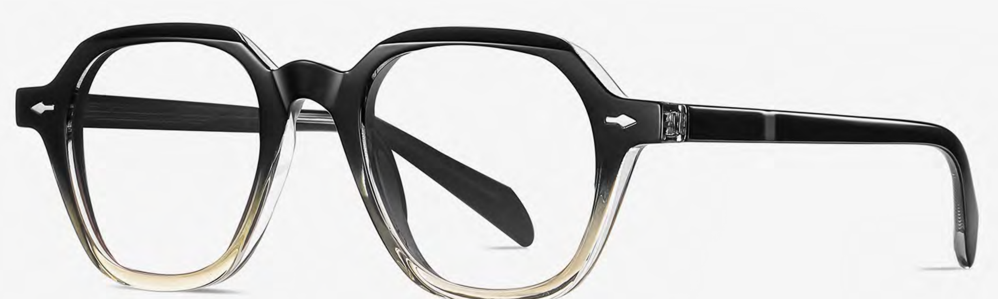
N0.8 Black - Creamy C4-1 (Anti blue light)