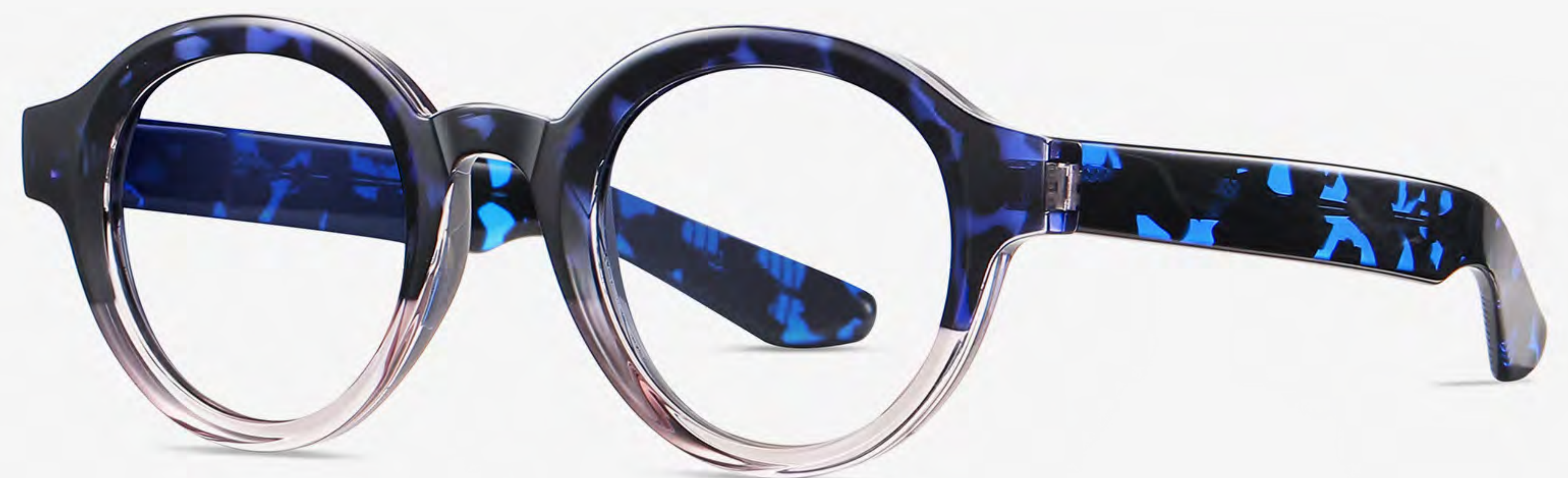
N0.8 Blue Demi Floral C4-1 (Anti blue light)