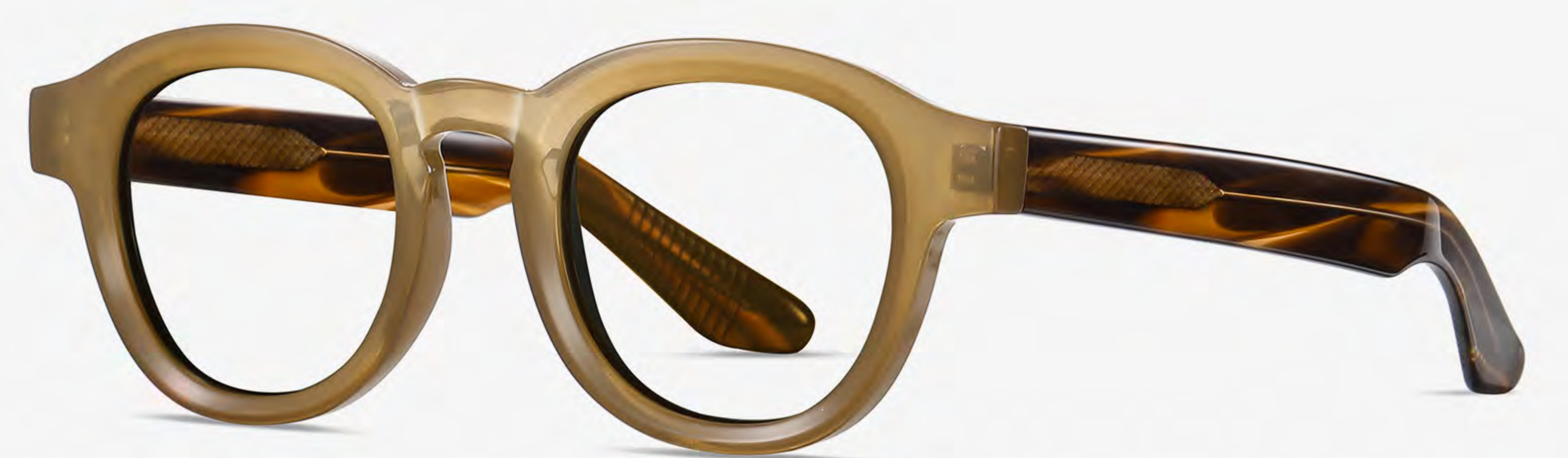
N0.7 Deep Brown C3-1 (Anti blue light)