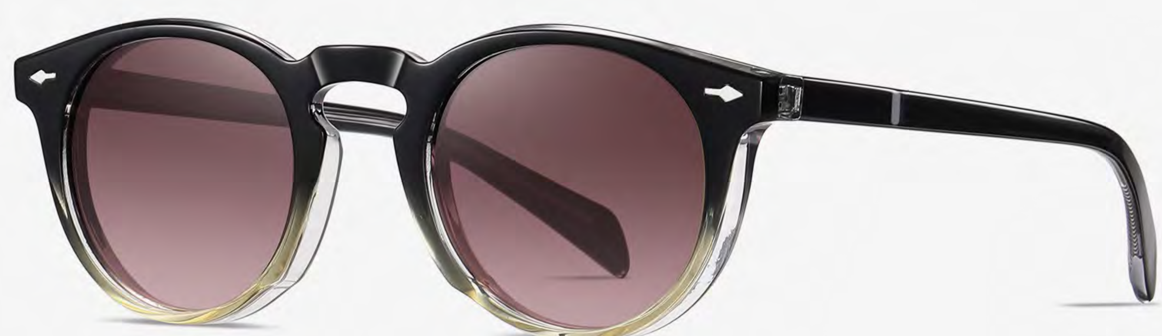
N0.4 Black - Creamy Tea C4 (1.1polarized light)