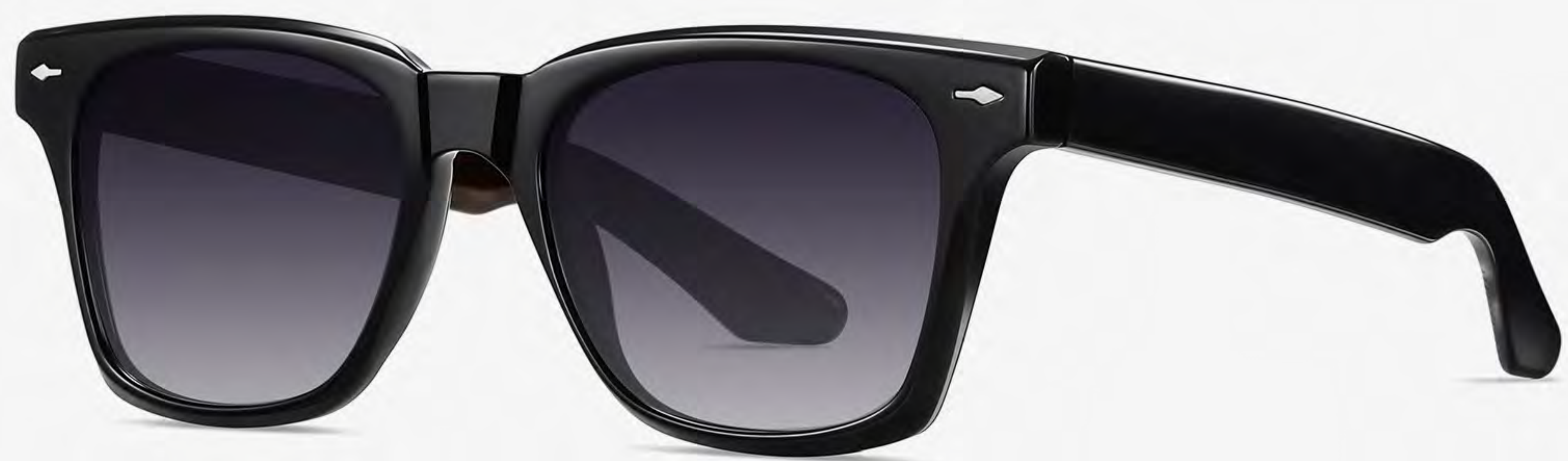
N0.2 Black Demi Floral Grey C2 (1.1polarized light)