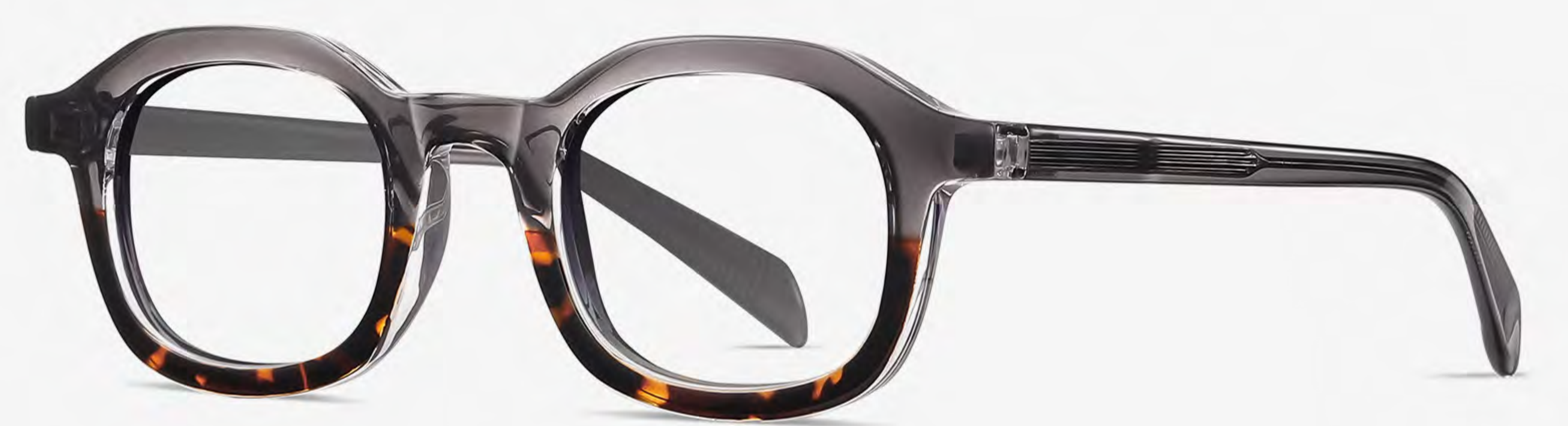
N0.8 Grey - Demi Floral C4-1 (Anti blue light)