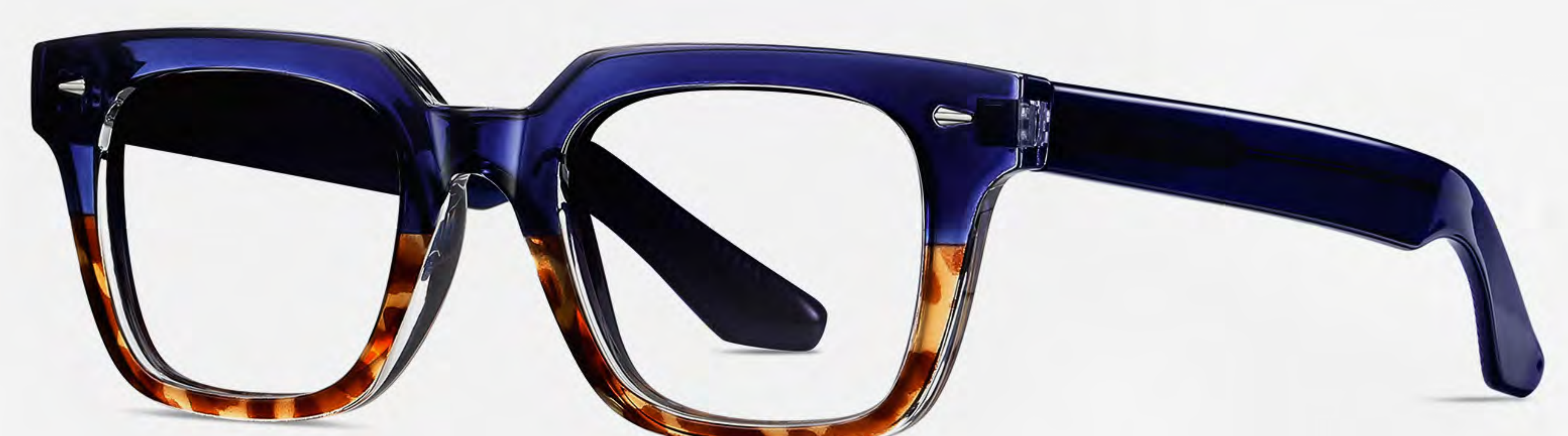
N0.8 Blue - Demi Floral C4-1 (Anti blue light)