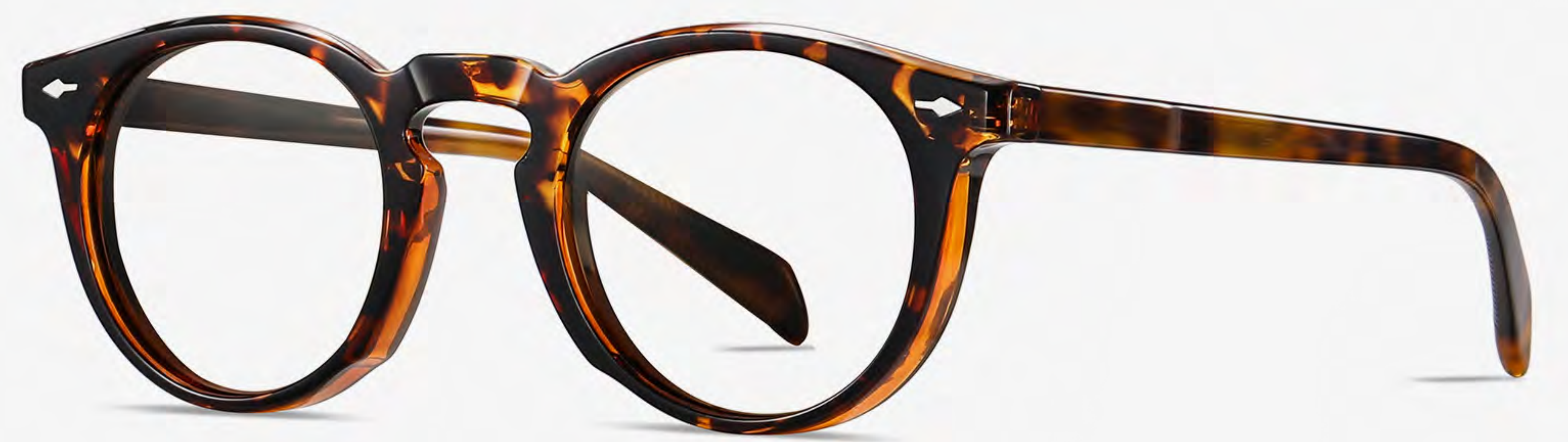
N0.6 Demi Floral C2-1 (Anti blue light)