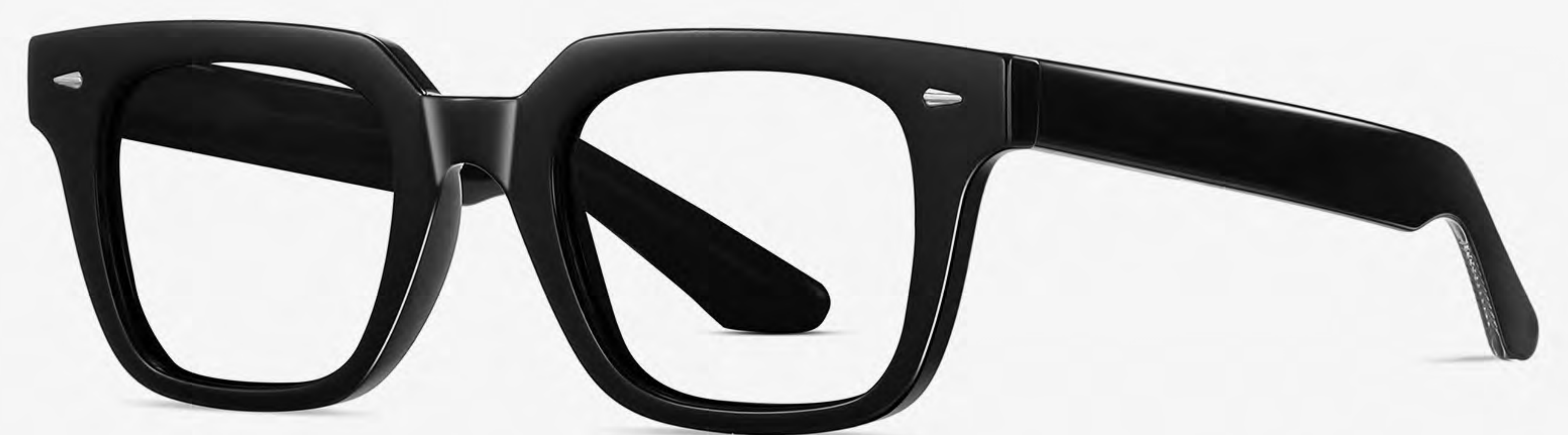
N0.5 Bright Black C1-1 (Anti blue light)