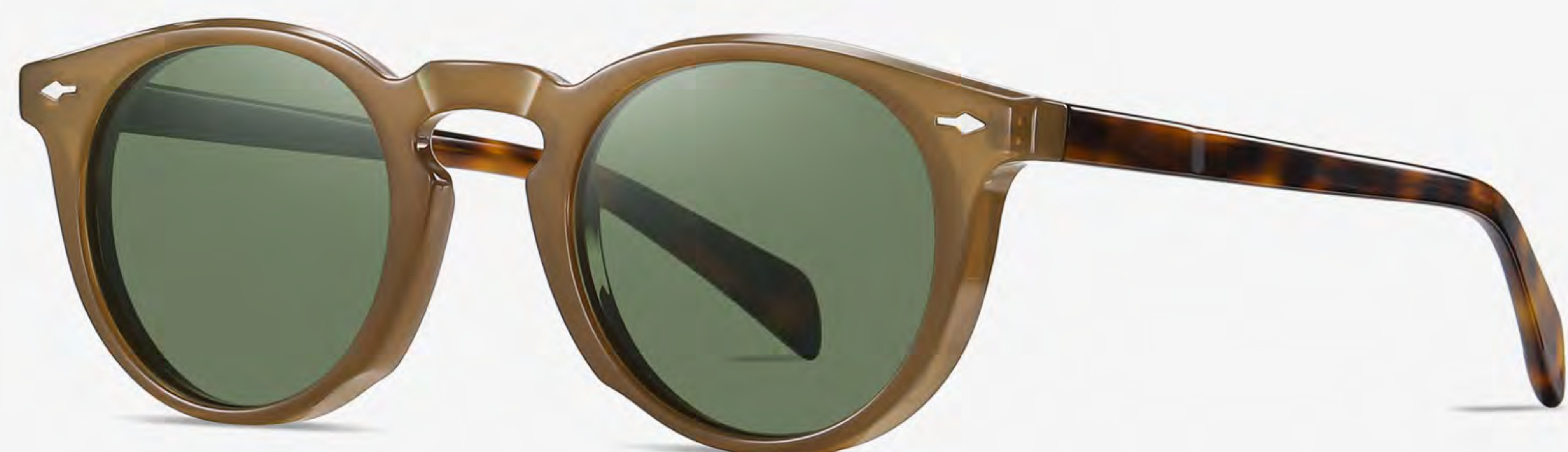
N0.3 Bright Brown Green C3 (1.1polarized light)