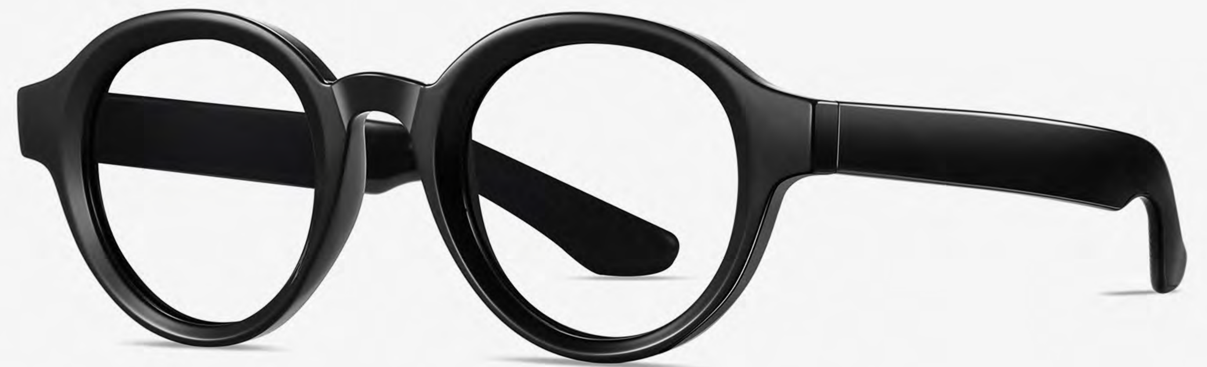
N0.5 Bright Black C1-1 (Anti blue light)