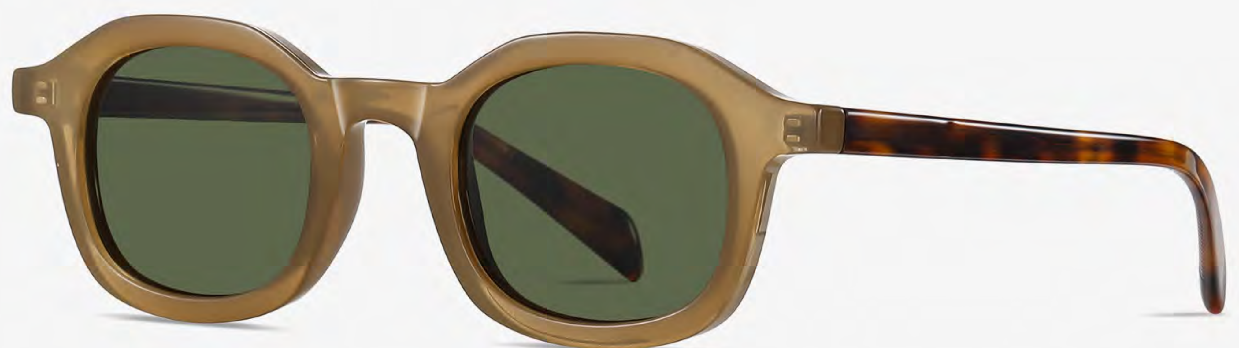
N0.3 Deep Brown Green C3 (1.1polarized light)