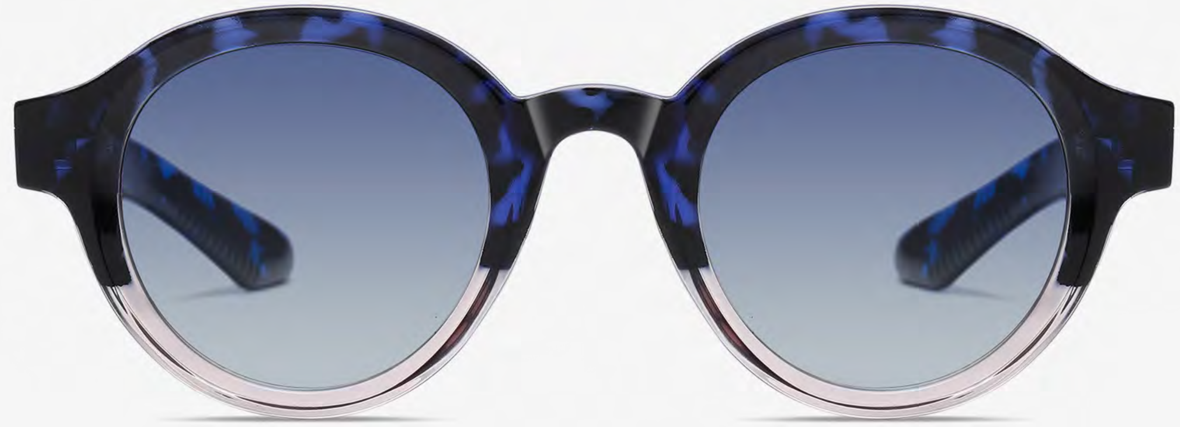
^ S31106 Size : 47-26-148