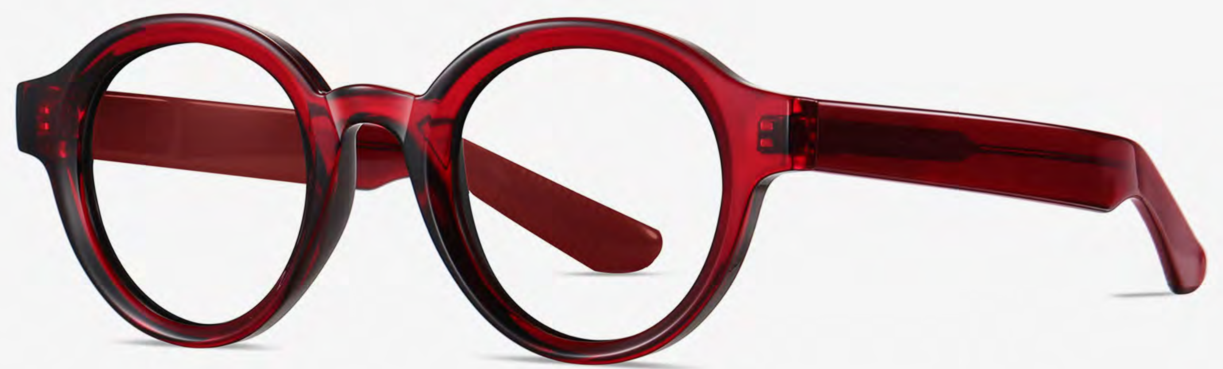
N0.7 Burgundy Red C3-1 (Anti blue light)