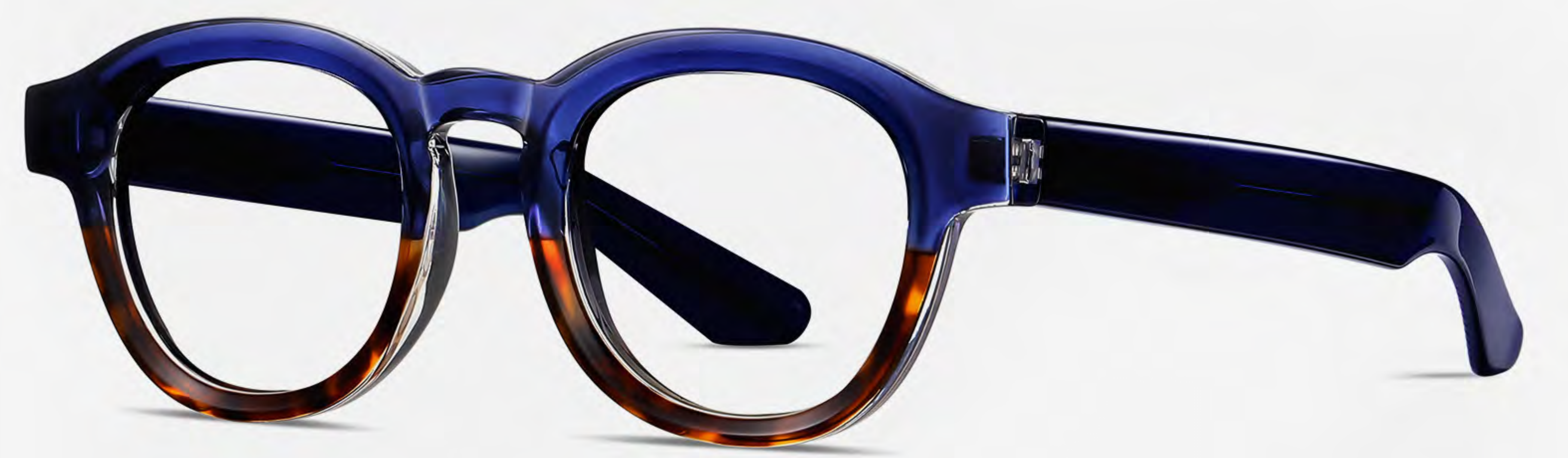
N0.8 Blue - Demi Floral C4-1 (Anti blue light)