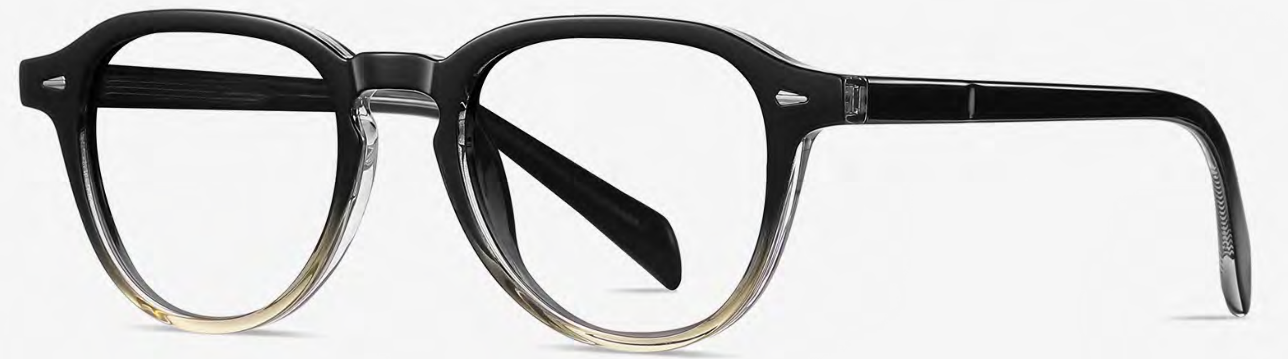
N0.8 Black - Green C4-1 (Anti blue light)