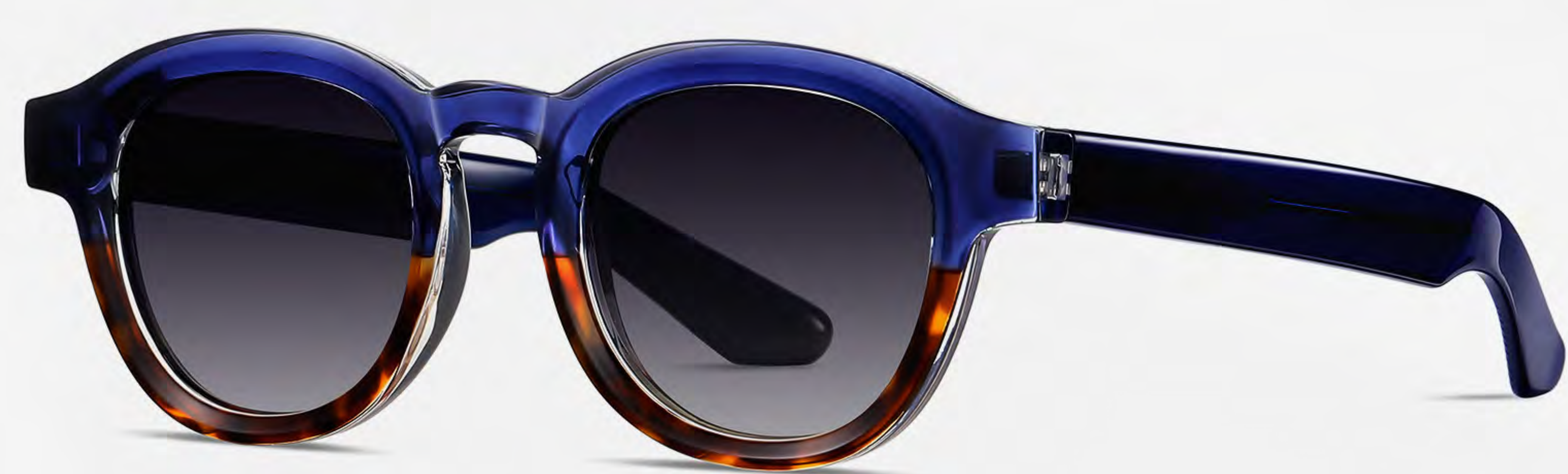
N0.4 Blue - Demi Floral Grey C4 (1.1polarized light)