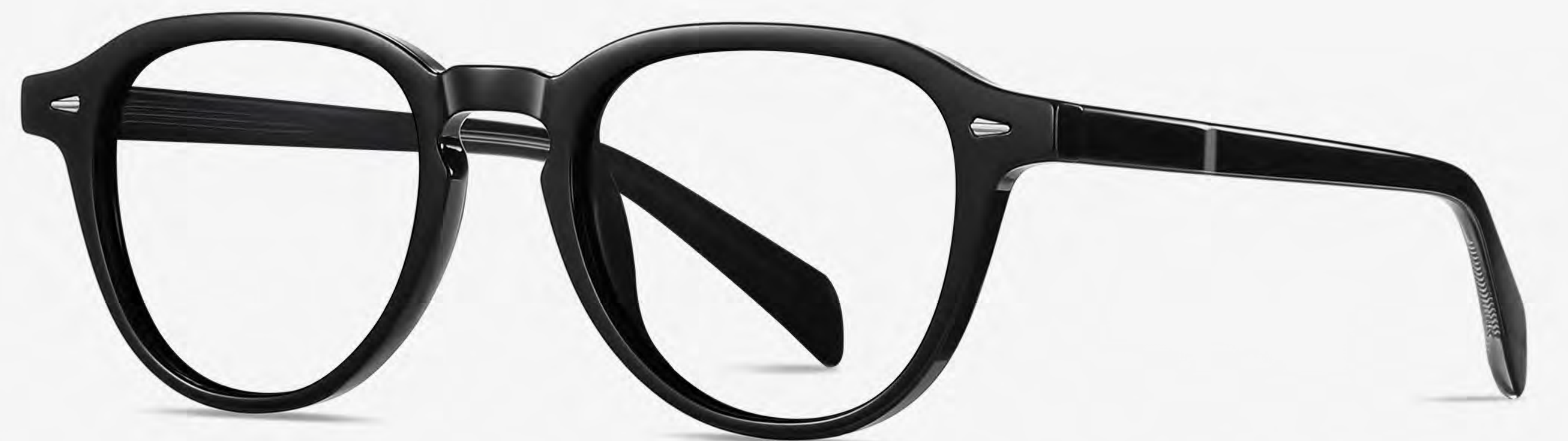
N0.5 Bright Black C1-1 (Anti blue light)