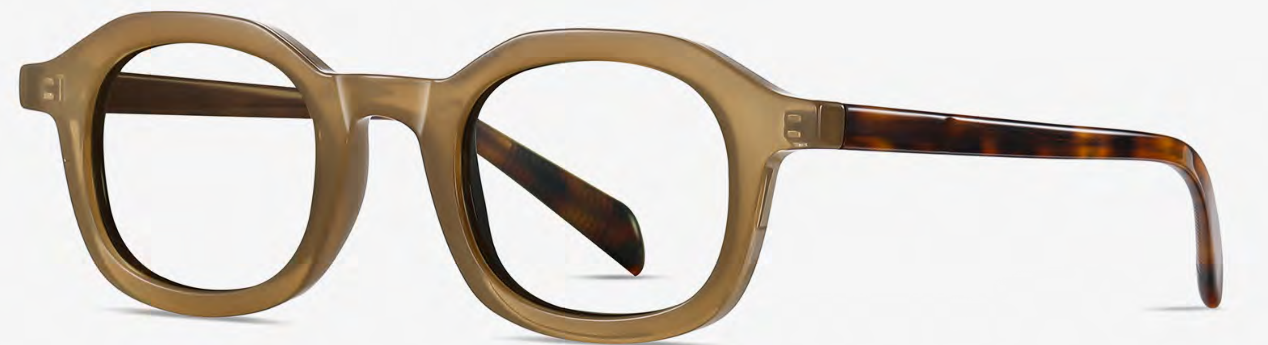
N0.7 Deep Brown C3-1 (Anti blue light)