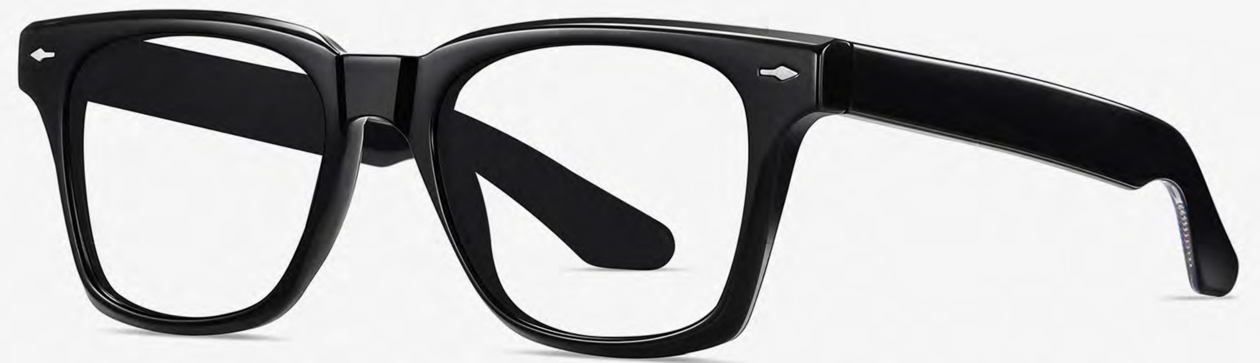
N0.5 Bright Black C1-1 (Anti blue light)