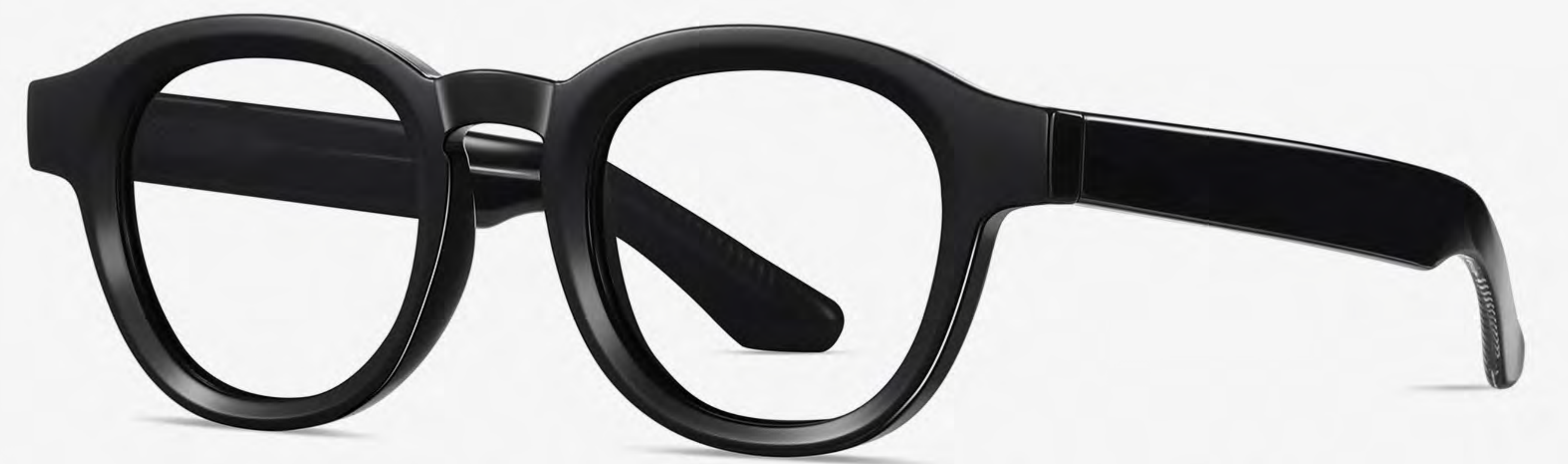
N0.5 Bright Black C1-1 (Anti blue light)