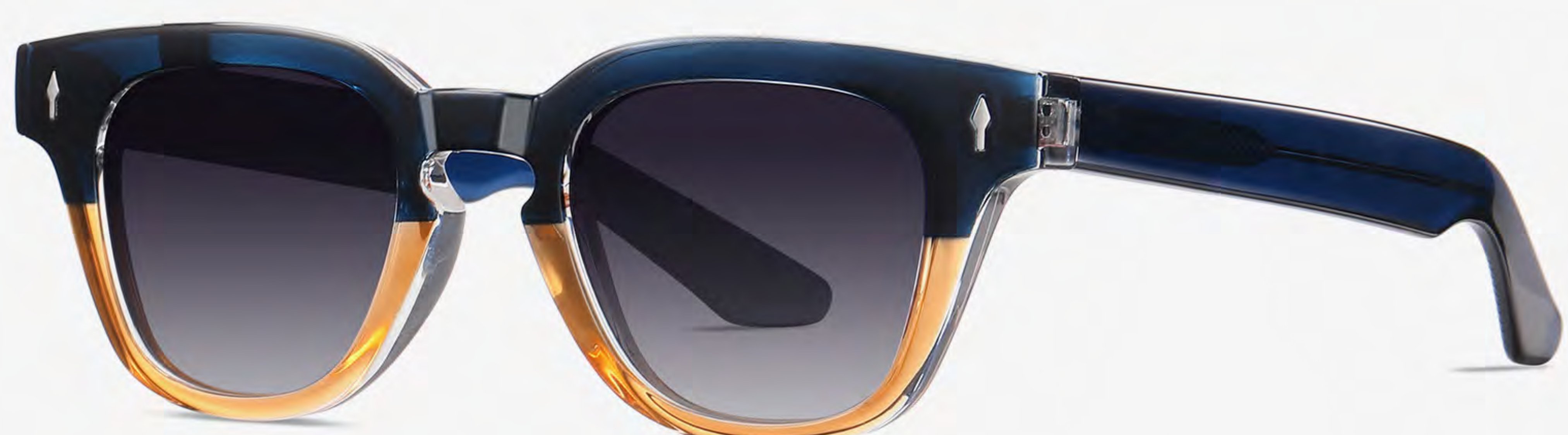
N0.4 Blue - Orange Grey C4 (1.1polarized light)