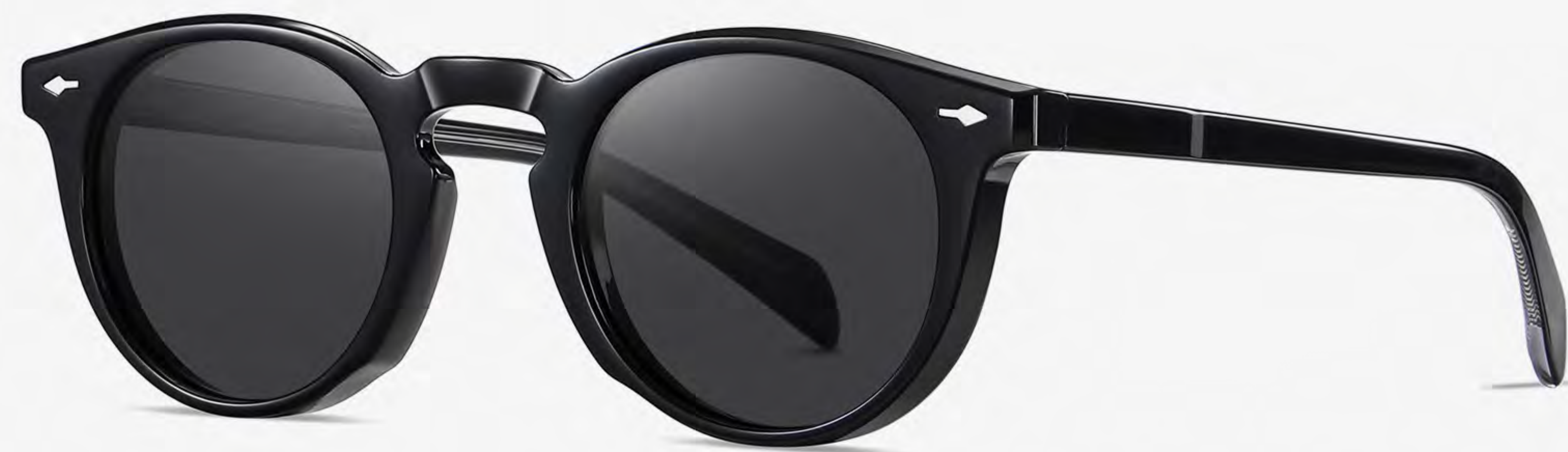
N0.1 Bright Black Grey C1 (1.1polarized light)