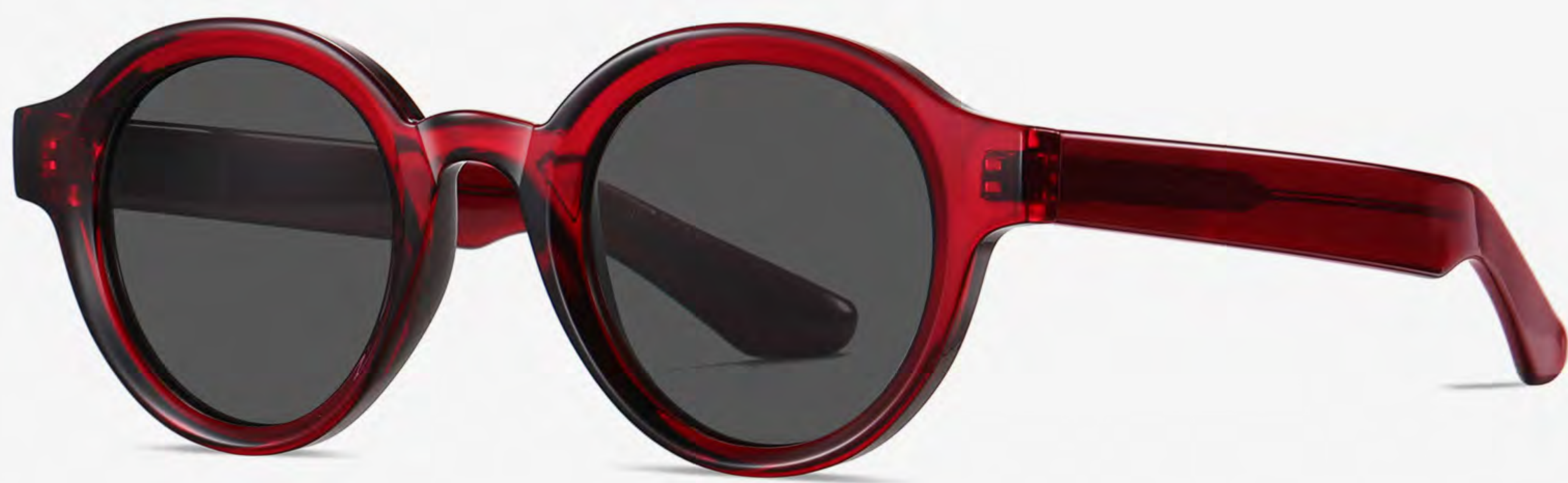
N0.3 Burgundy Red Grey C3 (1.1polarized light)