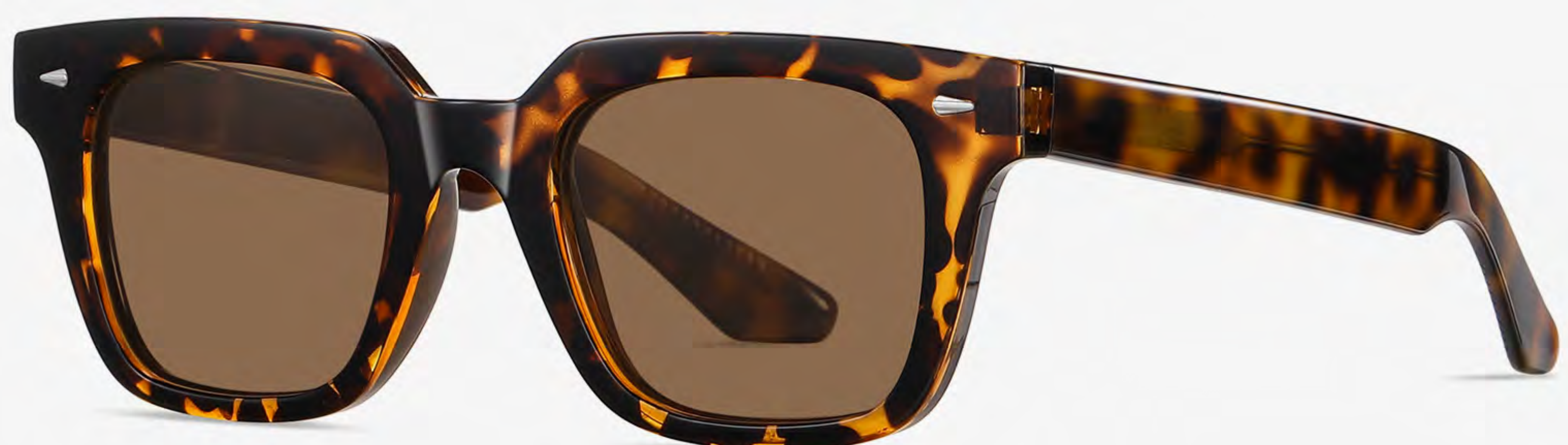
N0.3 Bright Tortoiseshell Tea C3 (1.1polarized light)