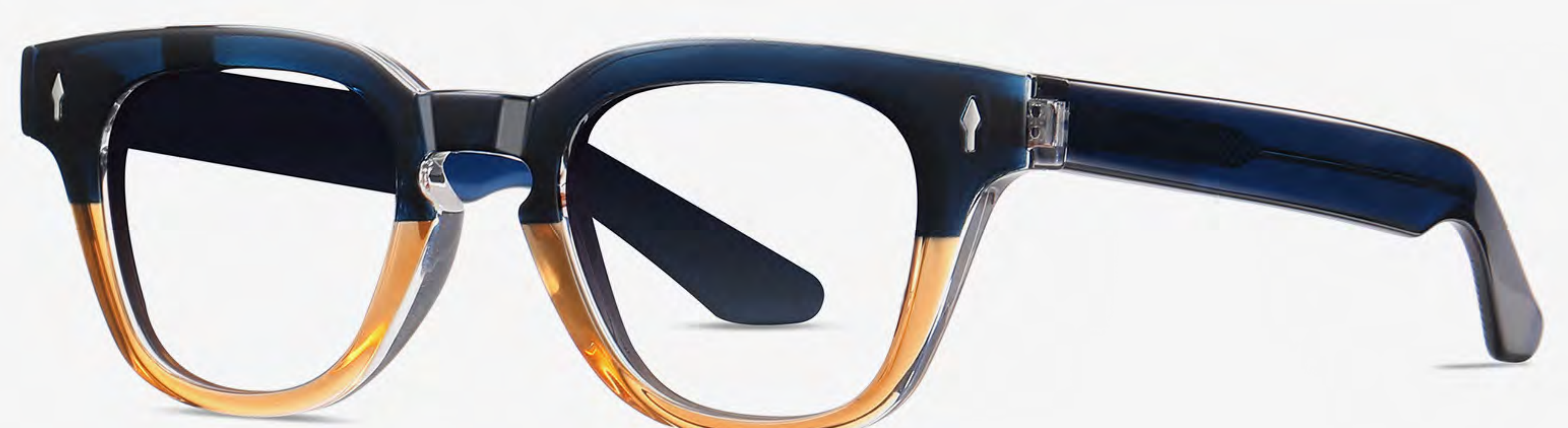
N0.8 Blue - Orange C4-1 (Anti blue light)