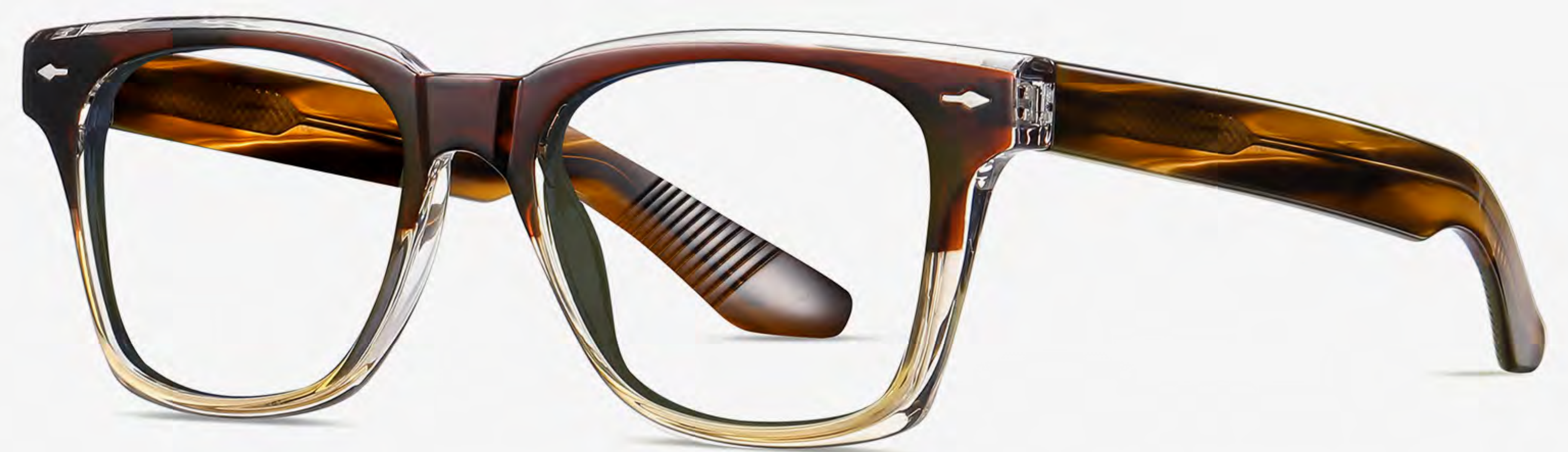
N0.7 Brown - Tea Blue C3-1 (Anti blue light)