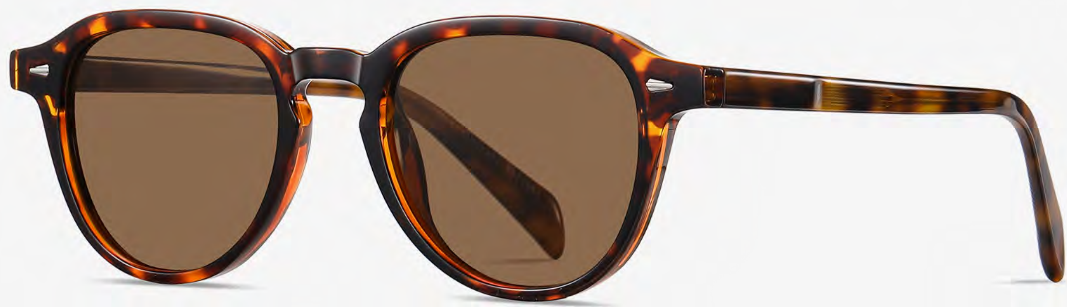
N0.2 Demi Floral Tea C2 (1.1polarized light)