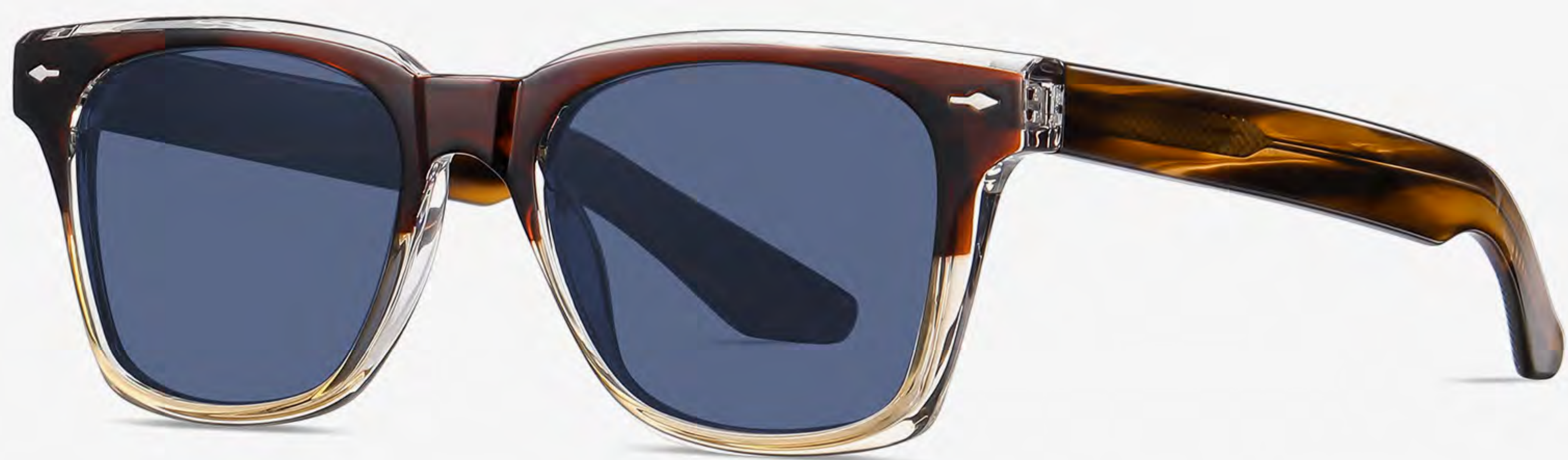
N0.3 Brown - Tea Blue Grey C3 (1.1polarized light)