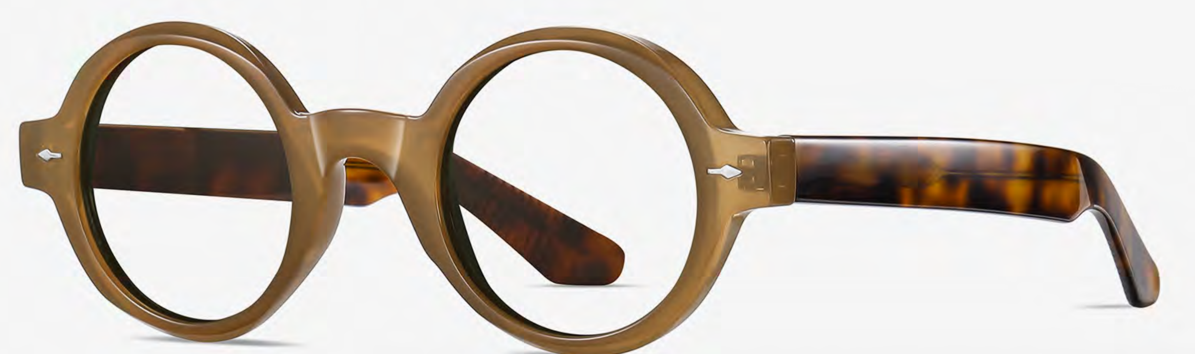
N0.7 Deep Brown C3-1 (Anti blue light)