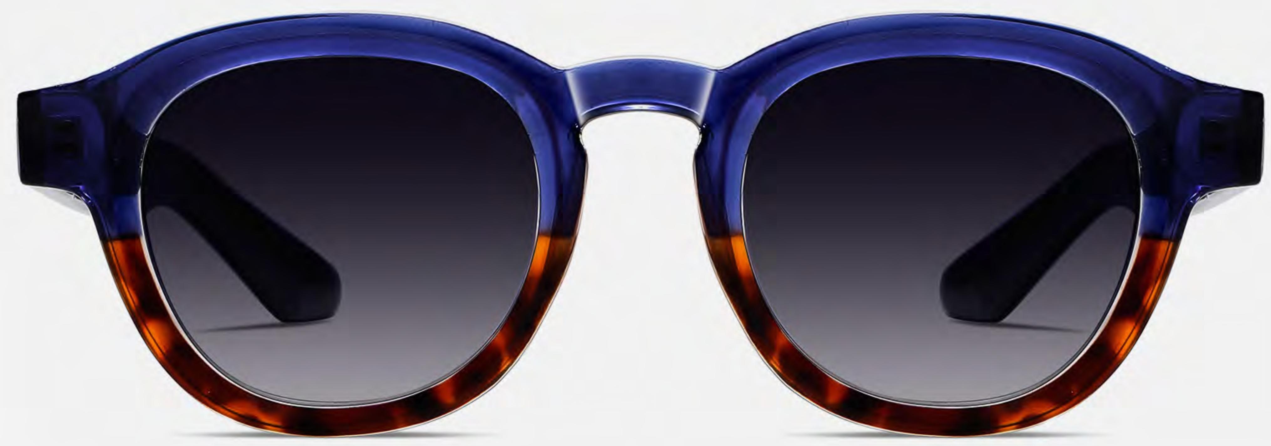
△ S31107 Size : 47-24-148