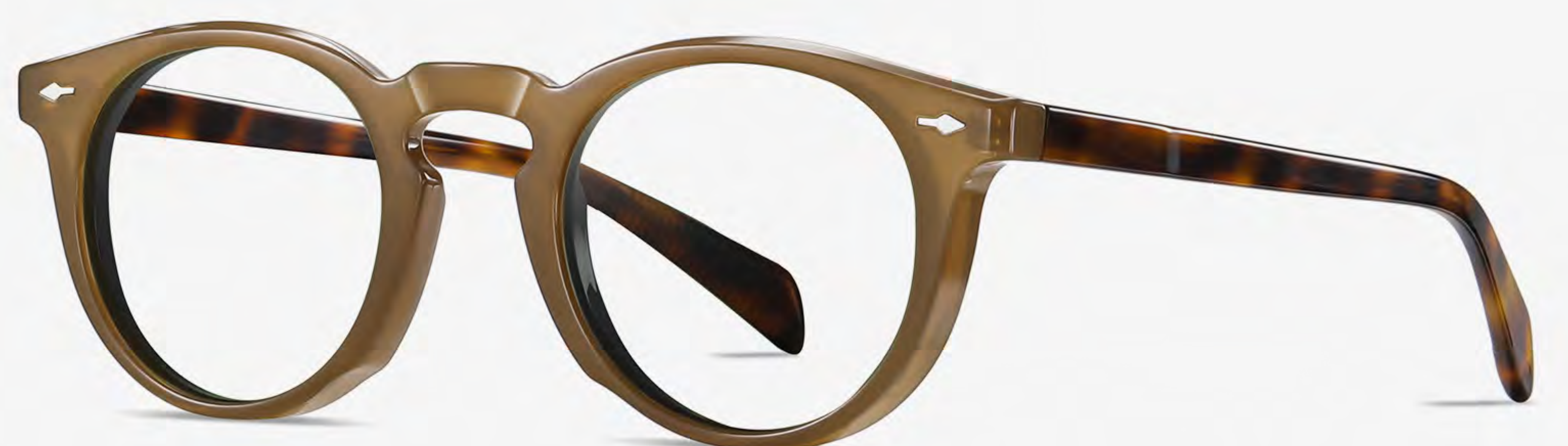
N0.7 Bright Brown C3-1 (Anti blue light)