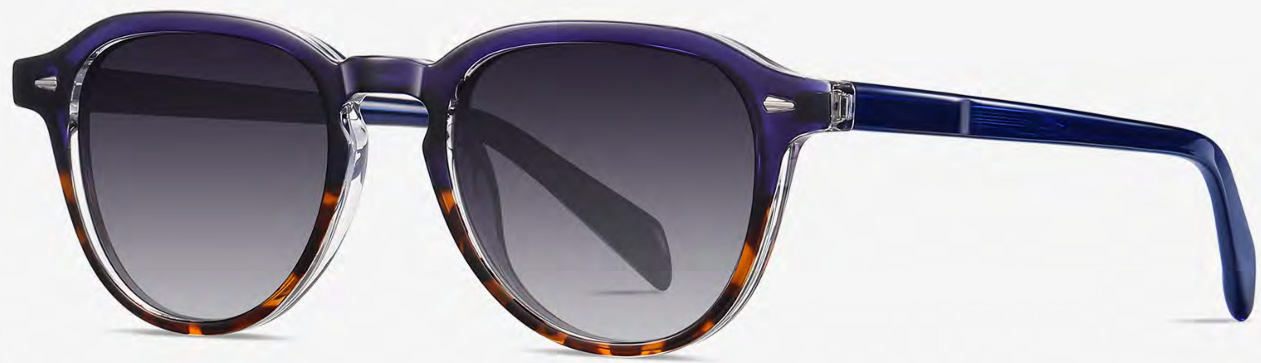
N0.3 Blue - Demi Floral Grey C3 (1.1polarized light)