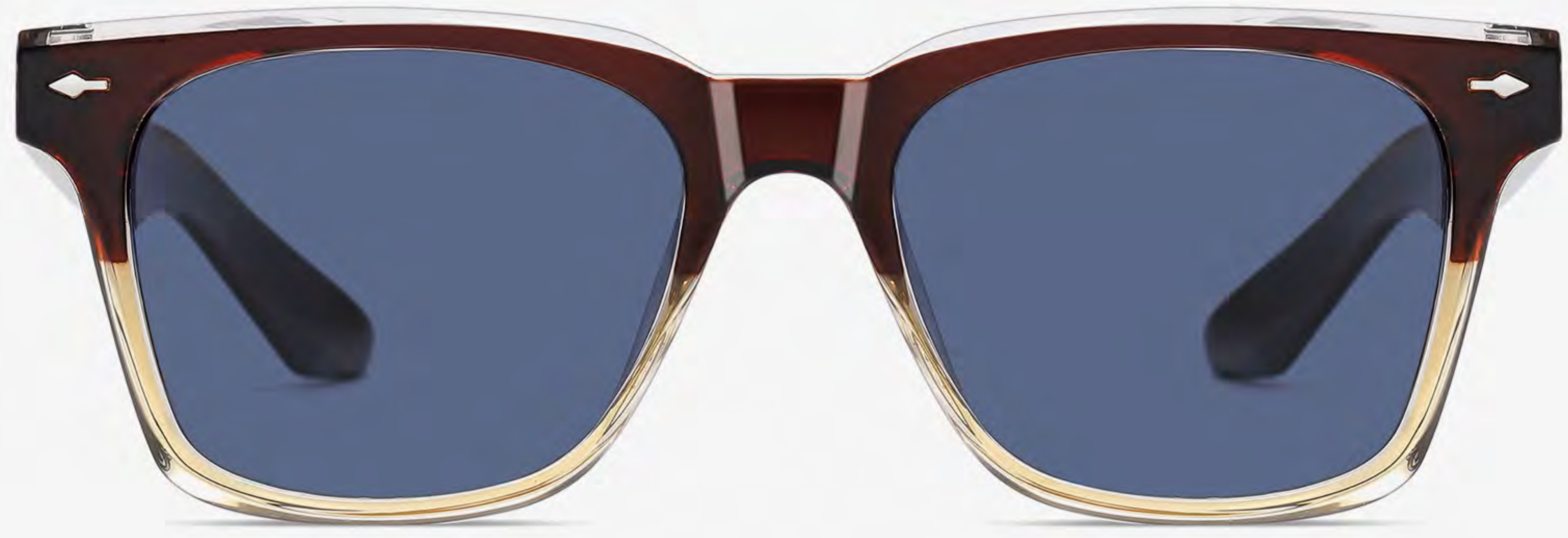
^ S31109 Size : 53-19-148