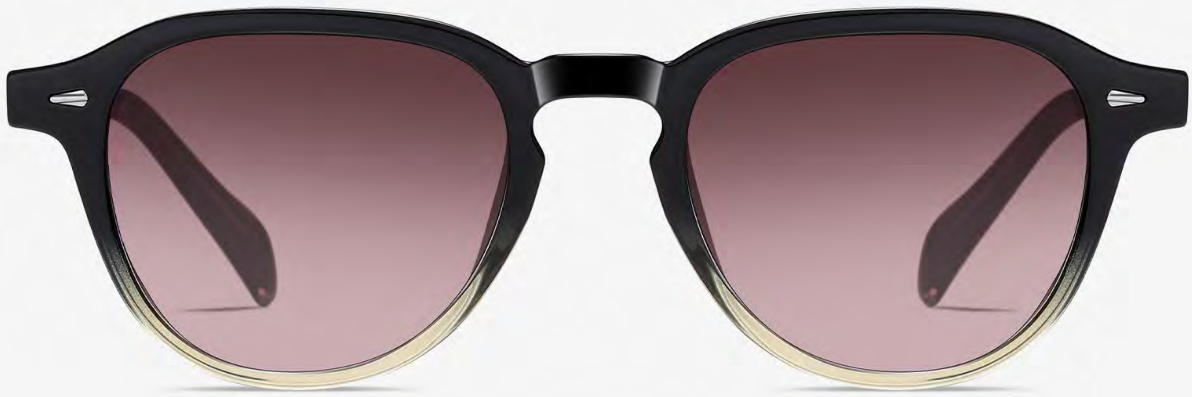
^ S31101 Size : 50-21-147