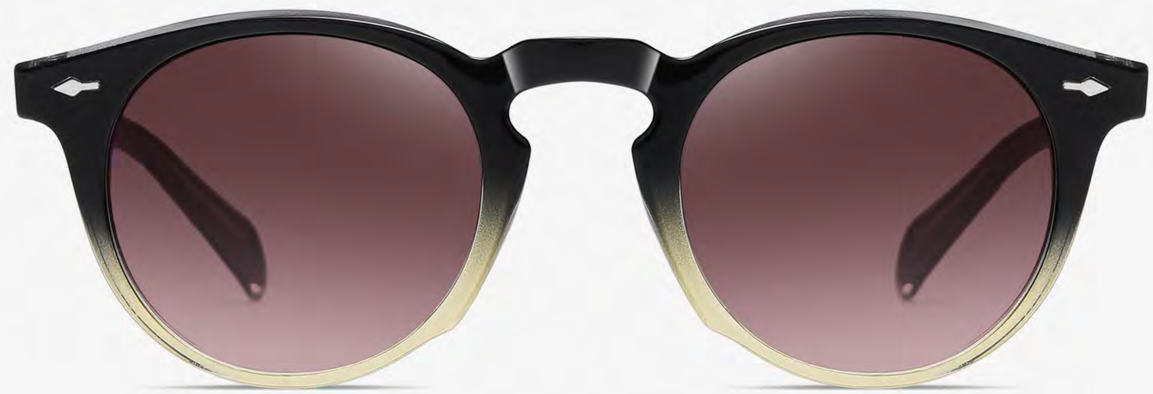
^ S31102 Size : 48-25-147