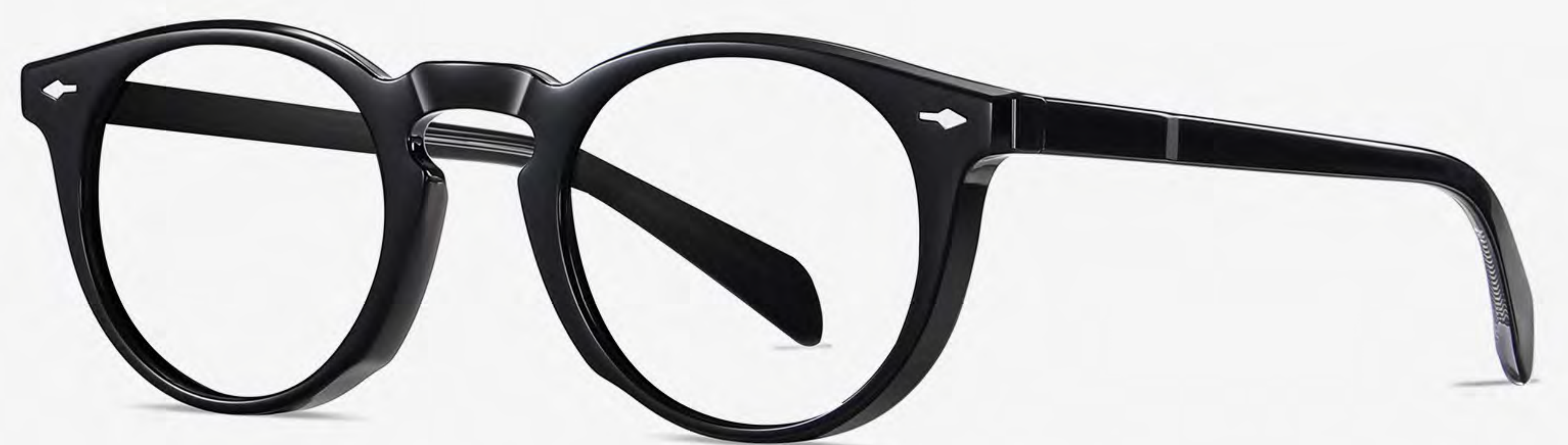
N0.5 Bright Black C1-1 (Anti blue light)