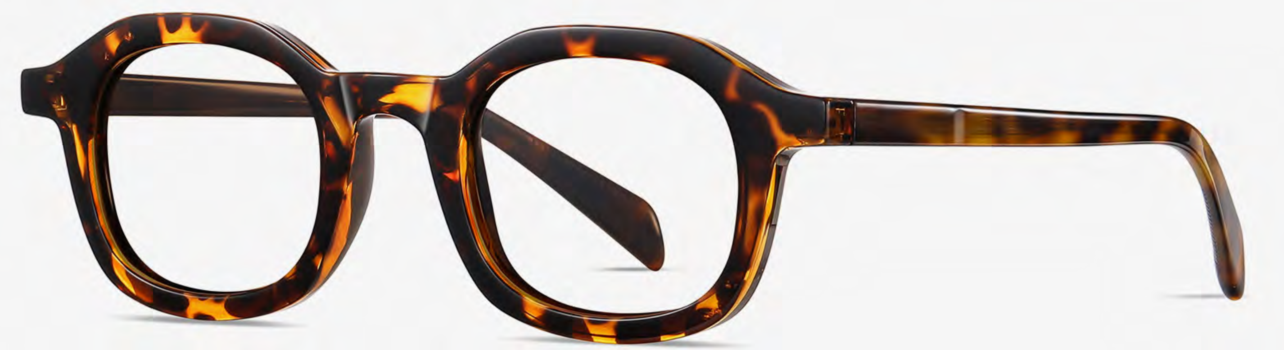
N0.6 Bright Tortoiseshell C2-1 (Anti blue light)