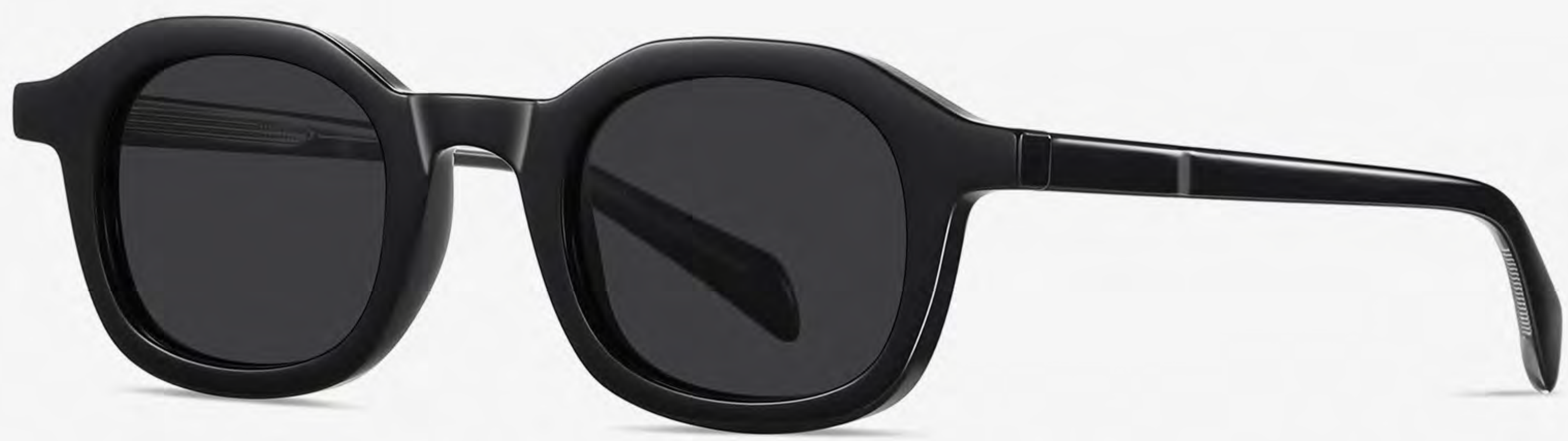
N0.1 Bright Black Grey C1 (1.1polarized light)