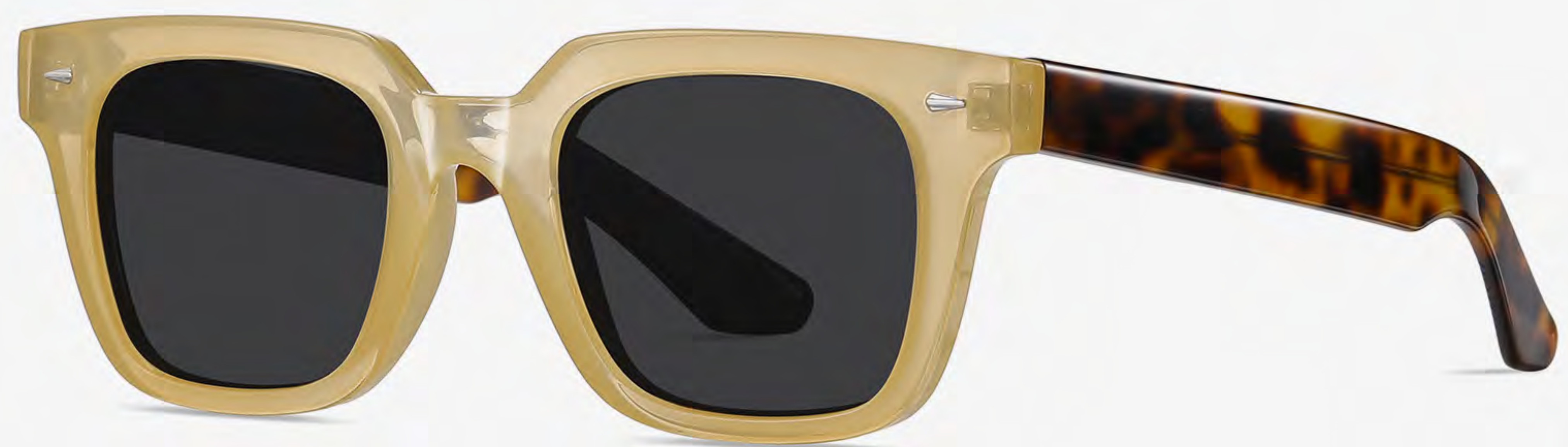
N0.2 Creamy Yellow Grey C2 (1.1polarized light)