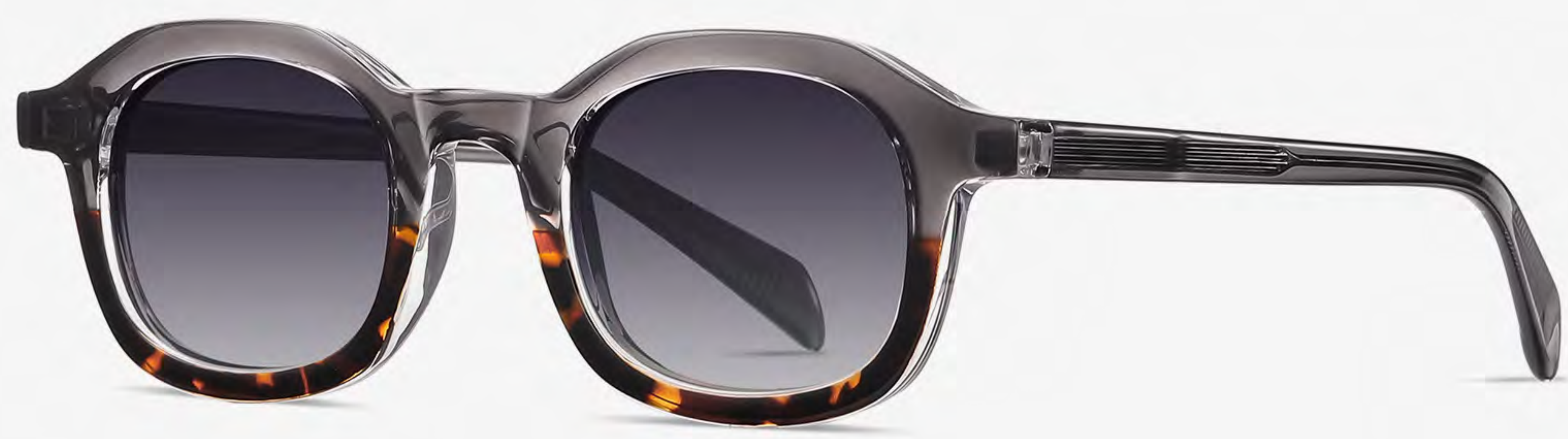
N0.4 Grey - Demi Floral Grey C4 (1.1polarized light)