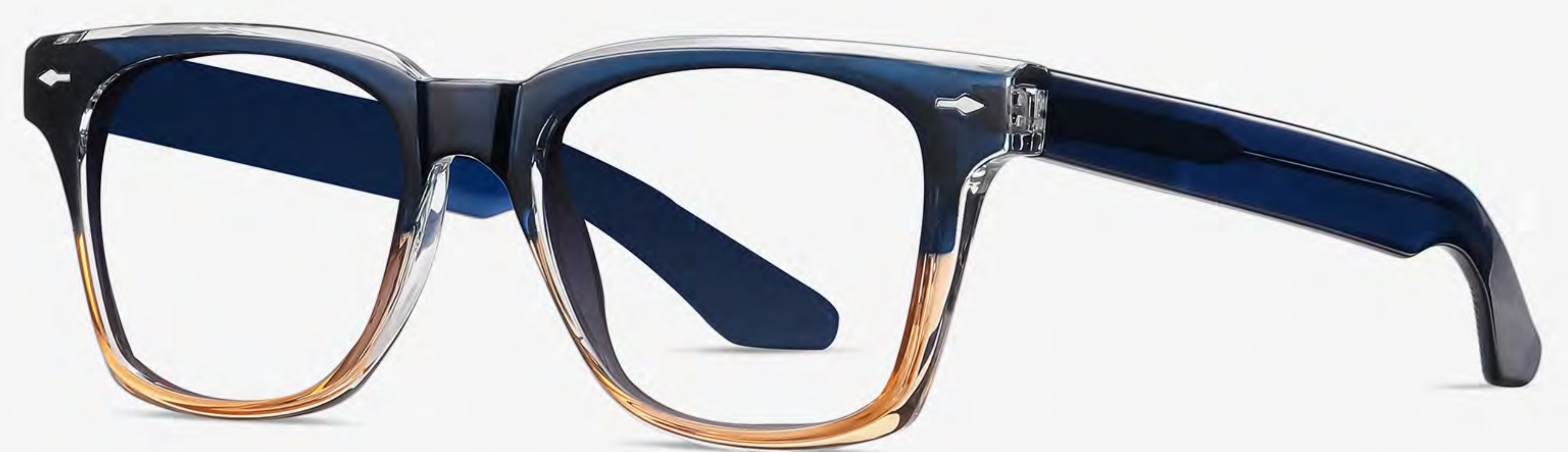
N0.8 Blue - Tea C4-1 (Anti blue light)