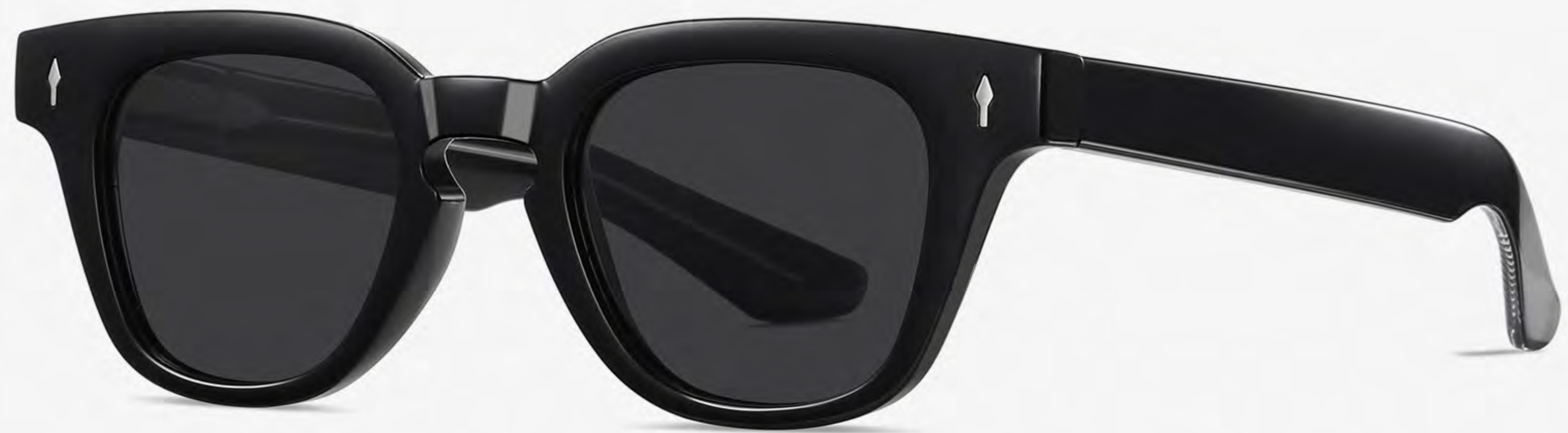
N0.1 Bright Black Grey C1 (1.1polarized light)