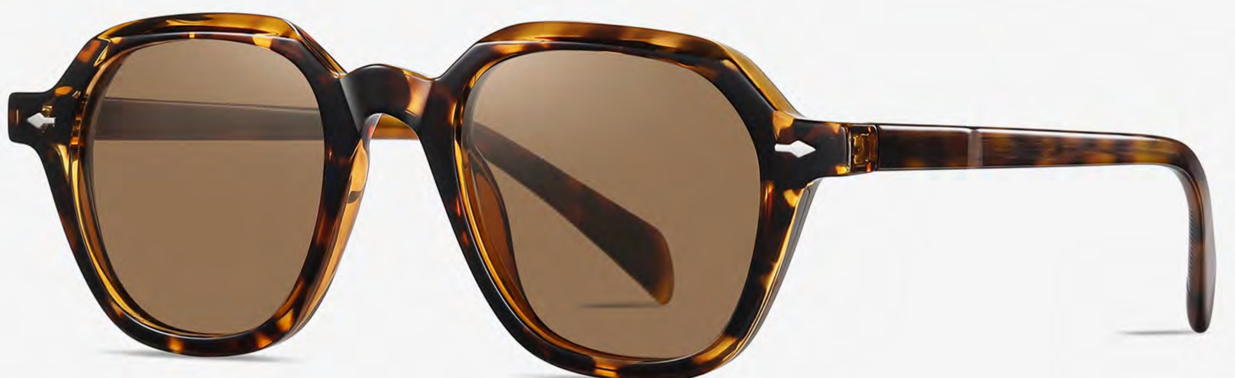
N0.2 Demi Floral Tea C2 (1.1polarized light)