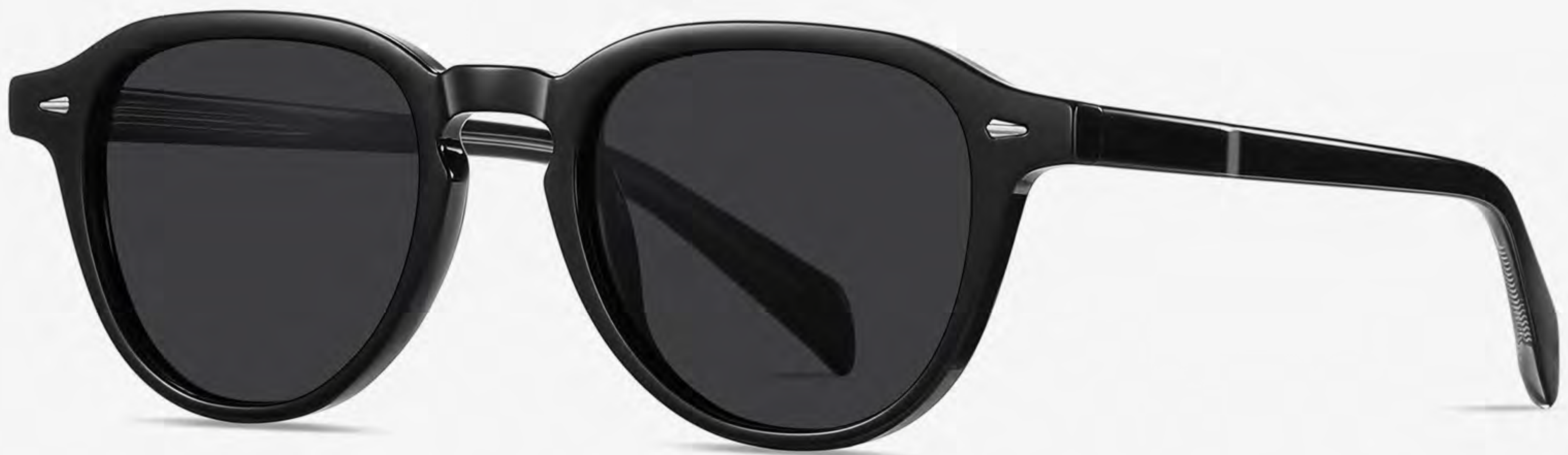
N0.1 Bright Black Grey C1 (1.1polarized light)