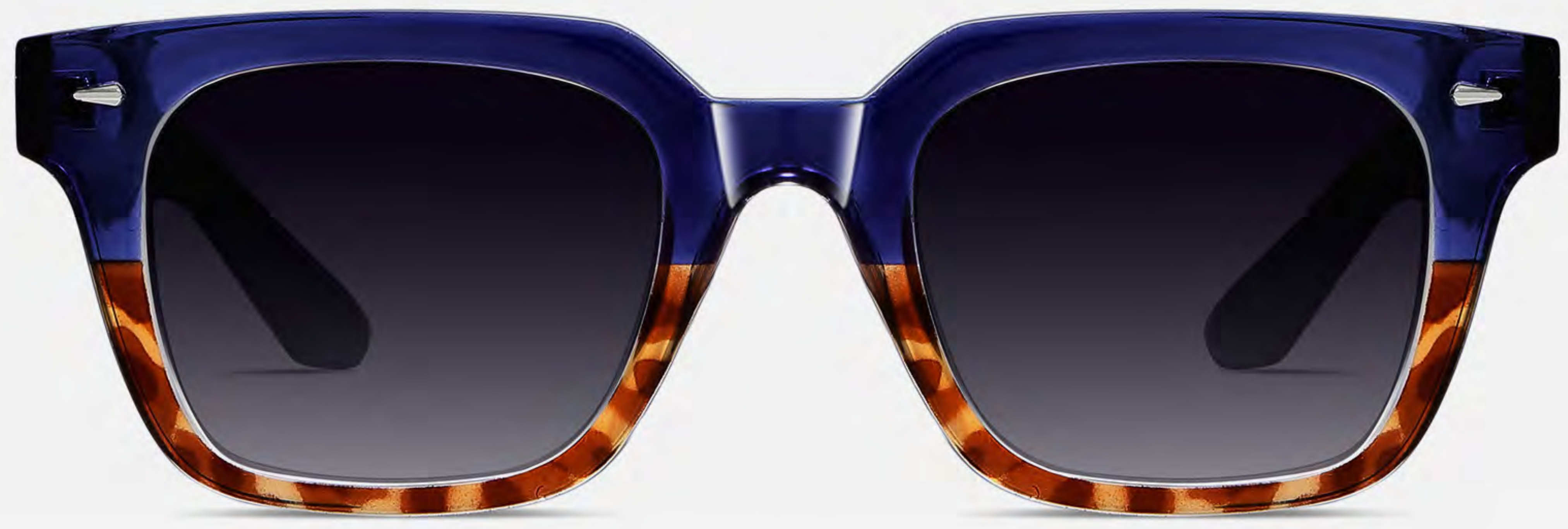
^ S31105 Size : 49-23-148