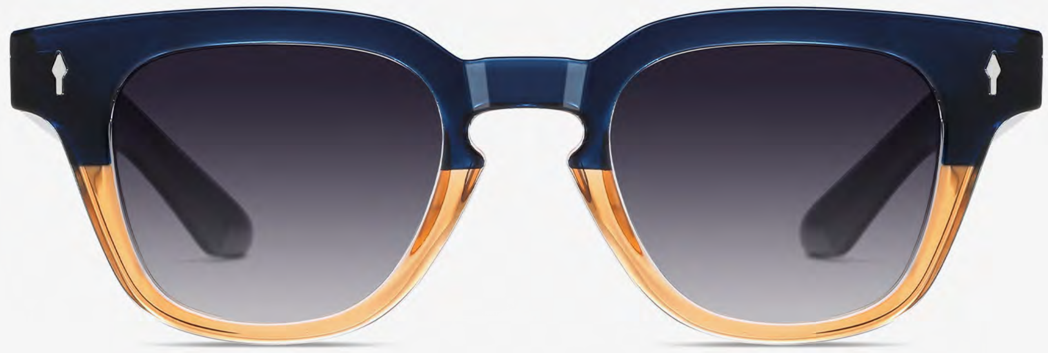
^ S31110 Size : 47-24-148