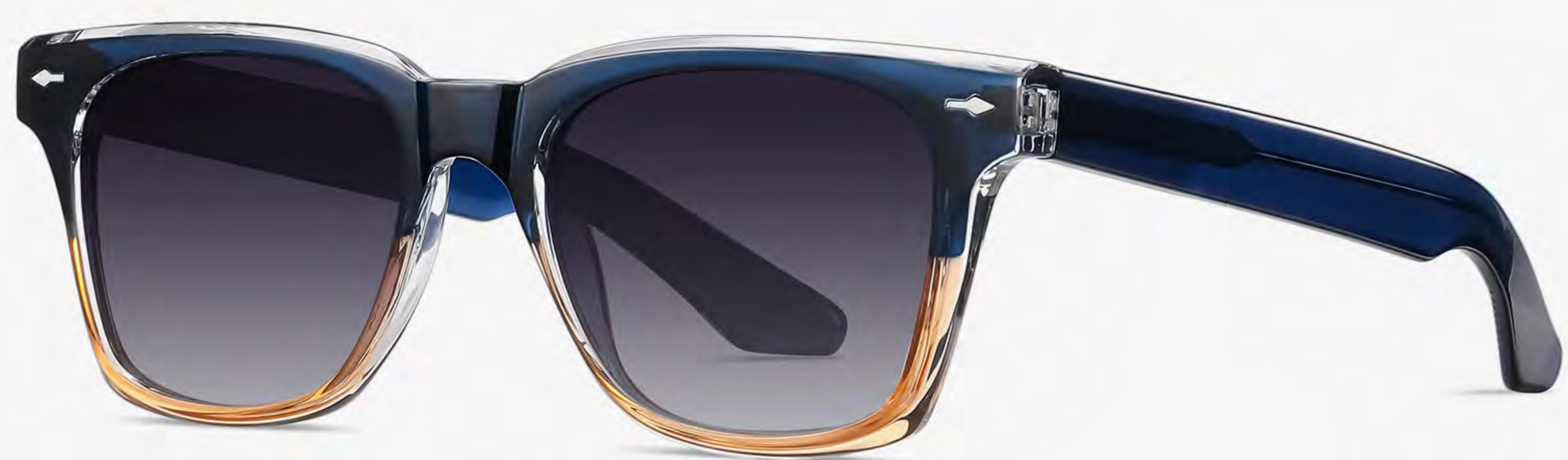
N0.4 Blue - Tea Gradient Grey C4 (1.1polarized light)