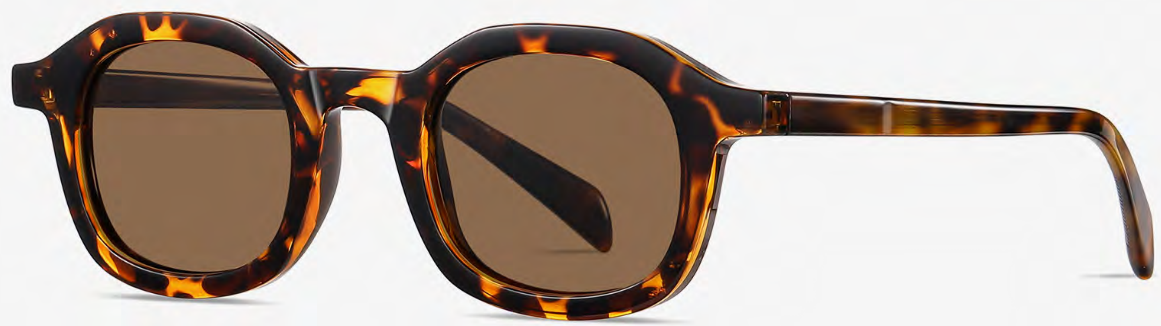
N0.2 Tortoiseshell Tea C2 (1.1polarized light)