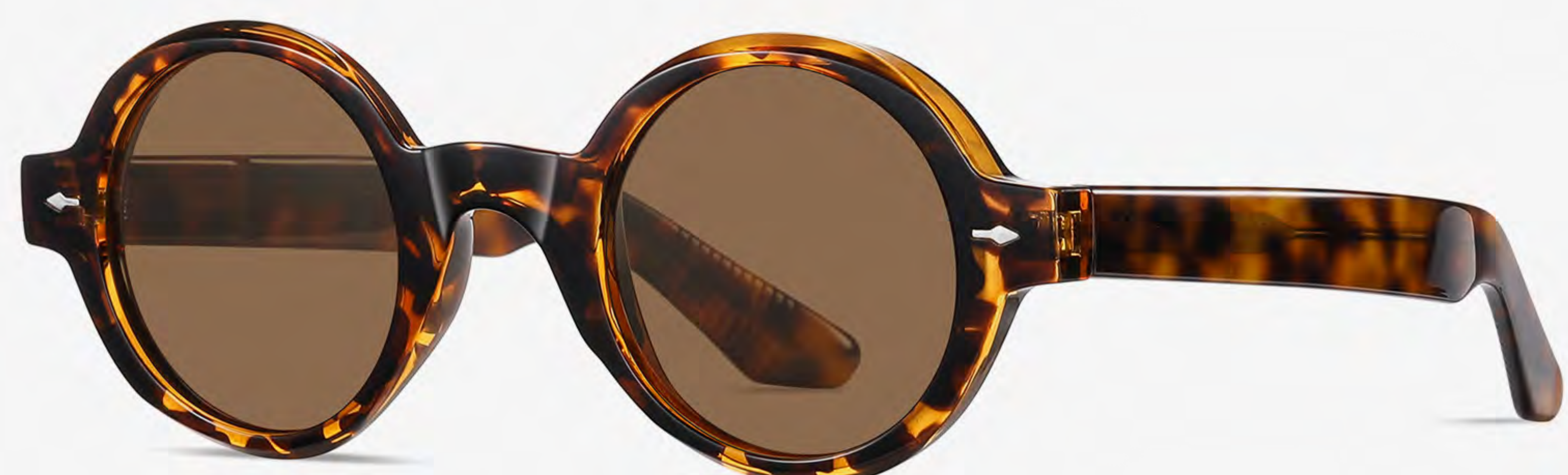
N0.2 Demi Floral Tea C2 (1.1polarized light)