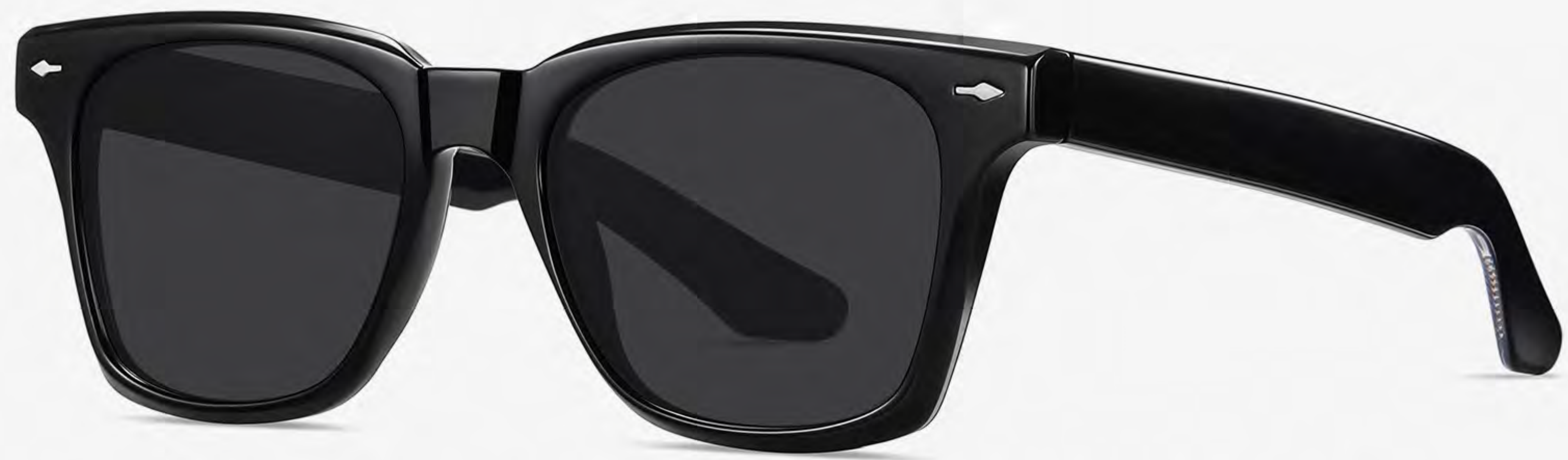
N0.1 Bright Black Grey C1 (1.1polarized light)