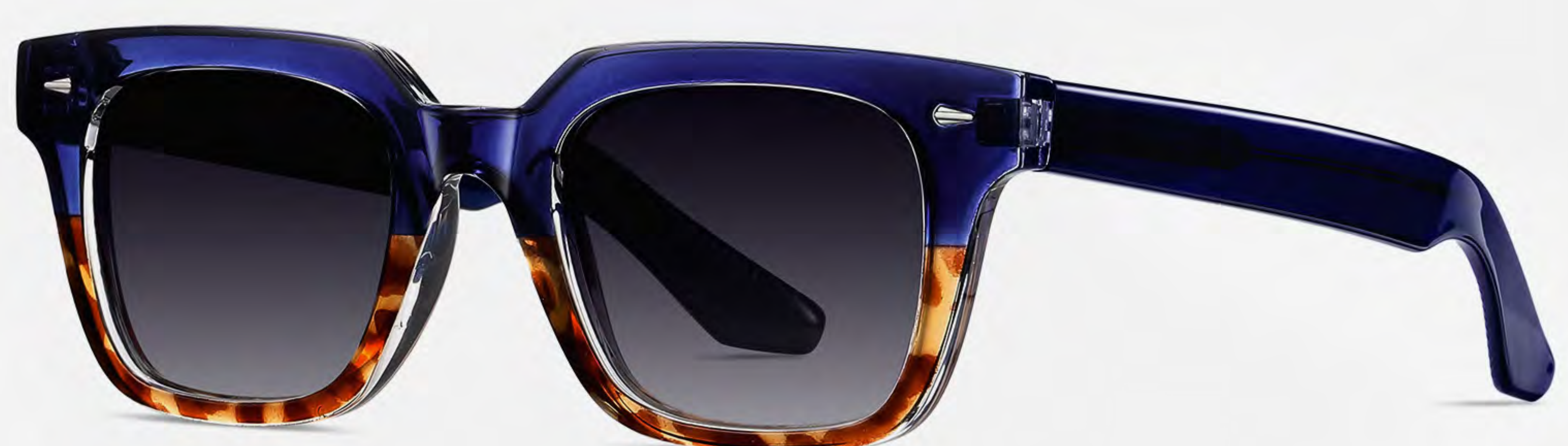
N0.4 Blue - Demi Floral Grey C4 (1.1polarized light)