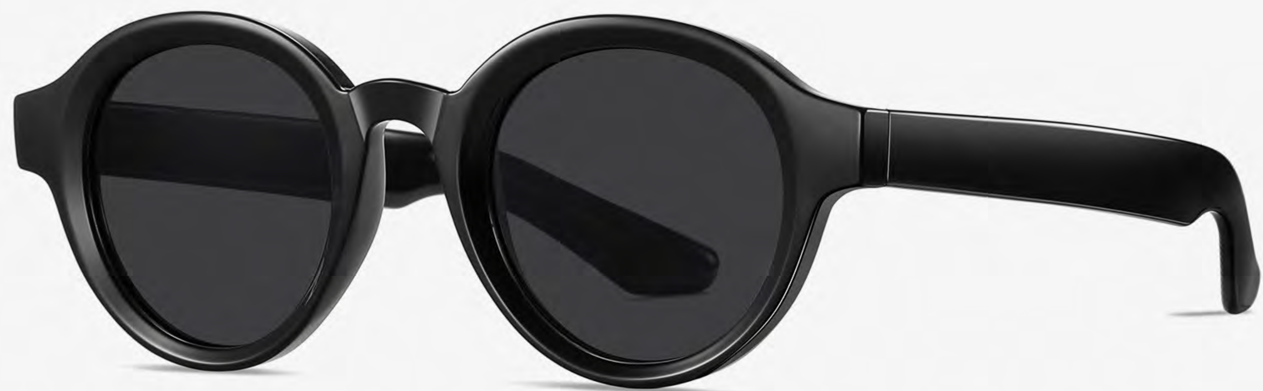
N0.1 Bright Black Grey C1 (1.1polarized light)