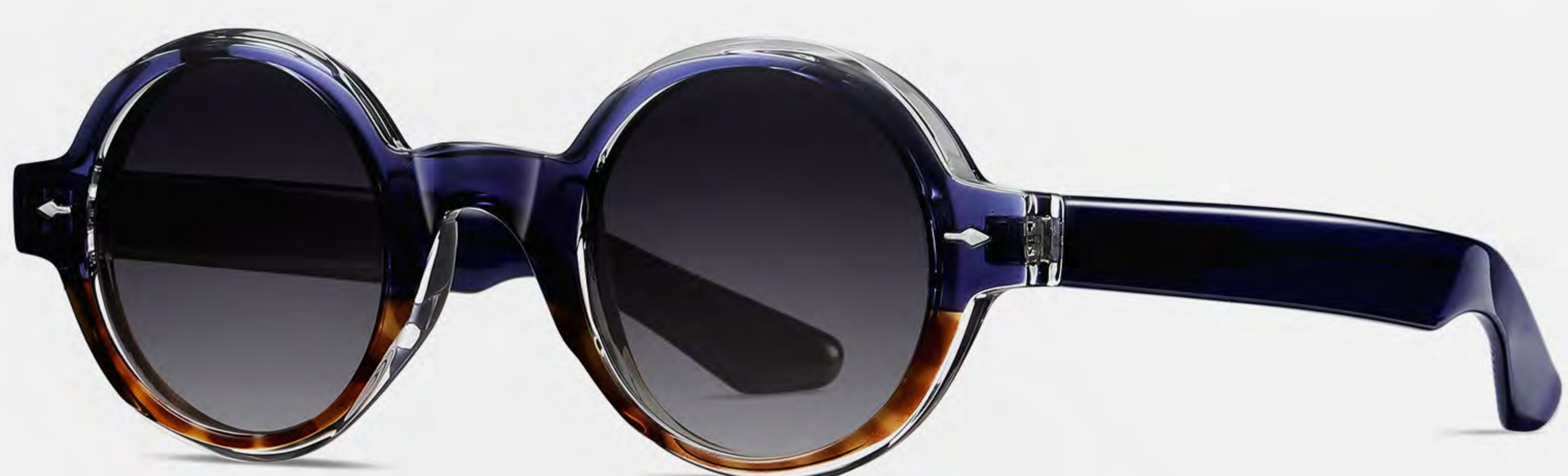
N0.4 Blue - Demi Floral Grey C4 (1.1polarized light)