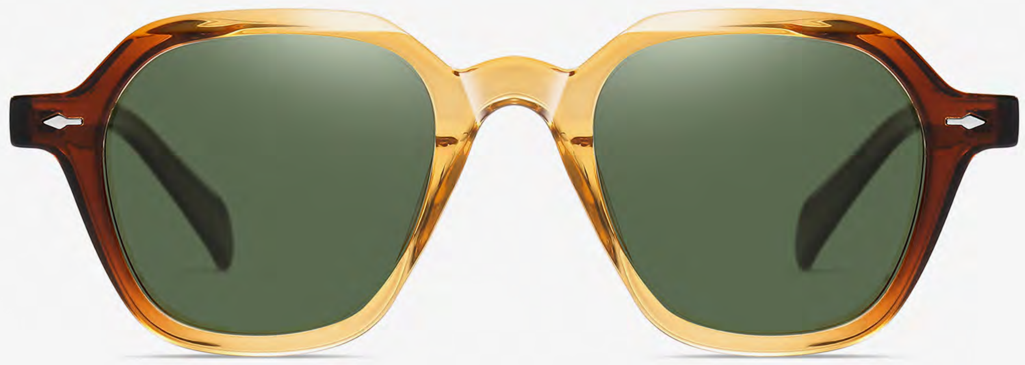
^ S31103 Size : 48-22-147