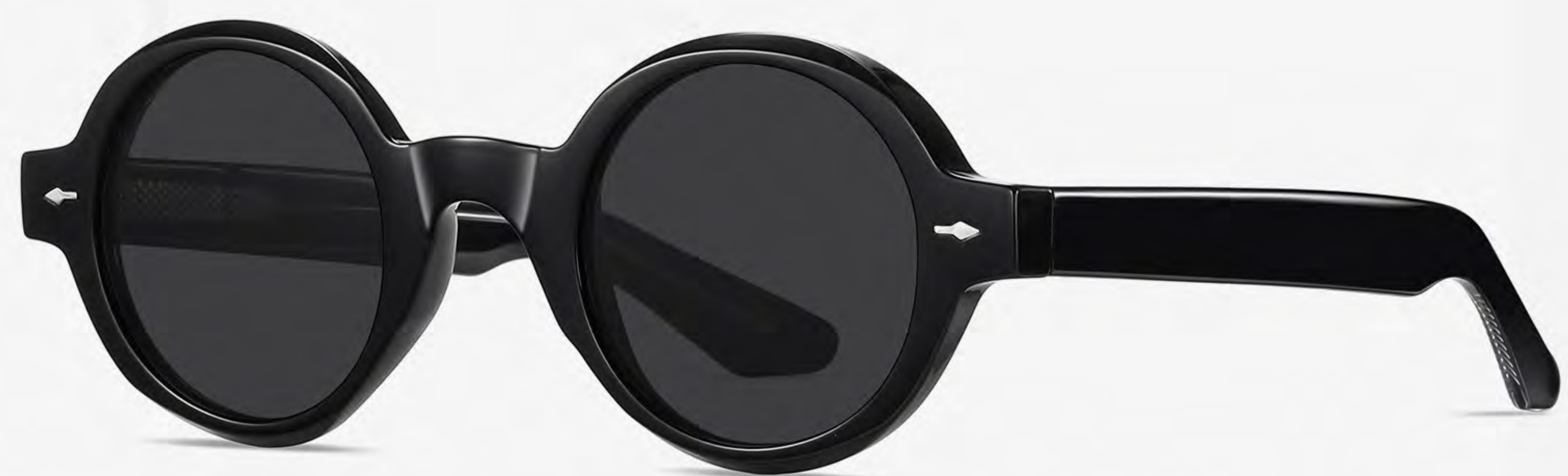
N0.1 Bright Black Grey C1 (1.1polarized light)