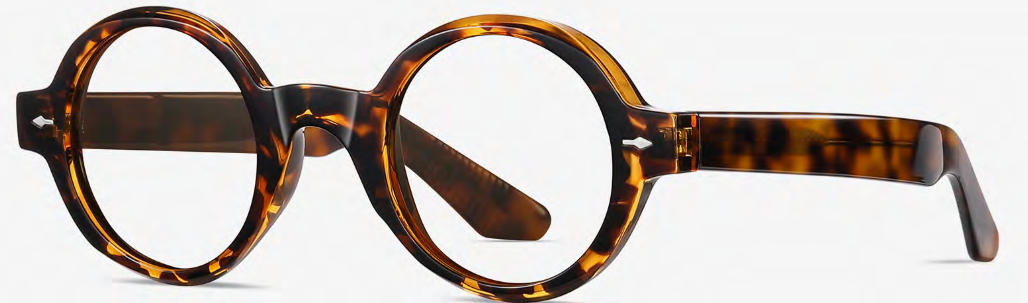
N0.6 Demi Floral C2-1 (Anti blue light)