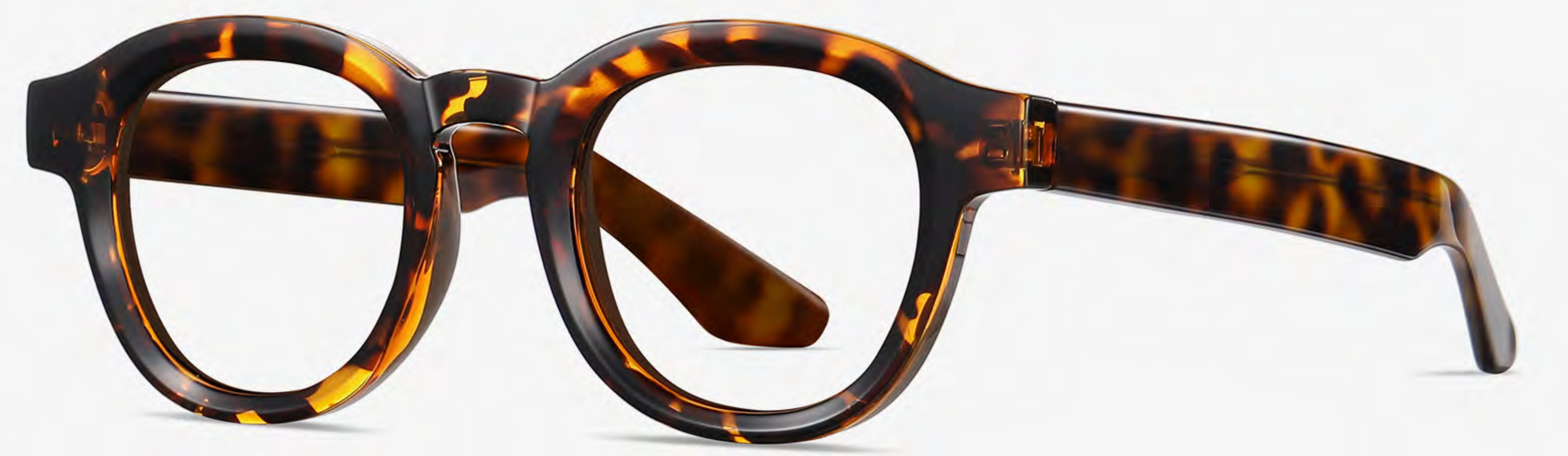
N0.6 Bright Tortoiseshell C2-1 (Anti blue light)