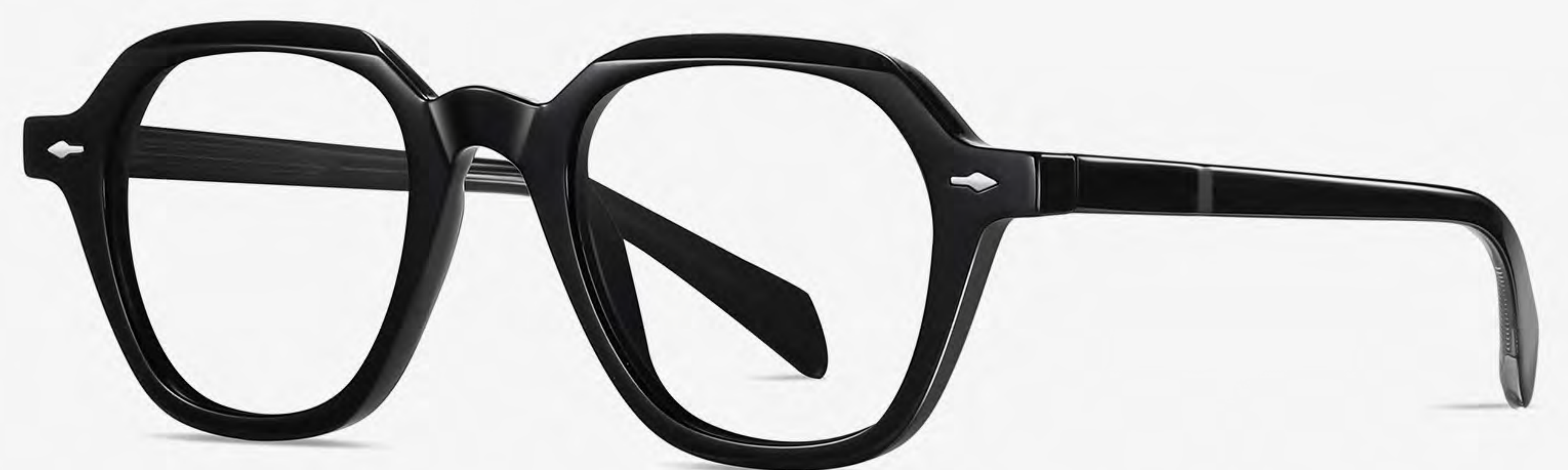
N0.5 Bright Black C1-1 (Anti blue light)