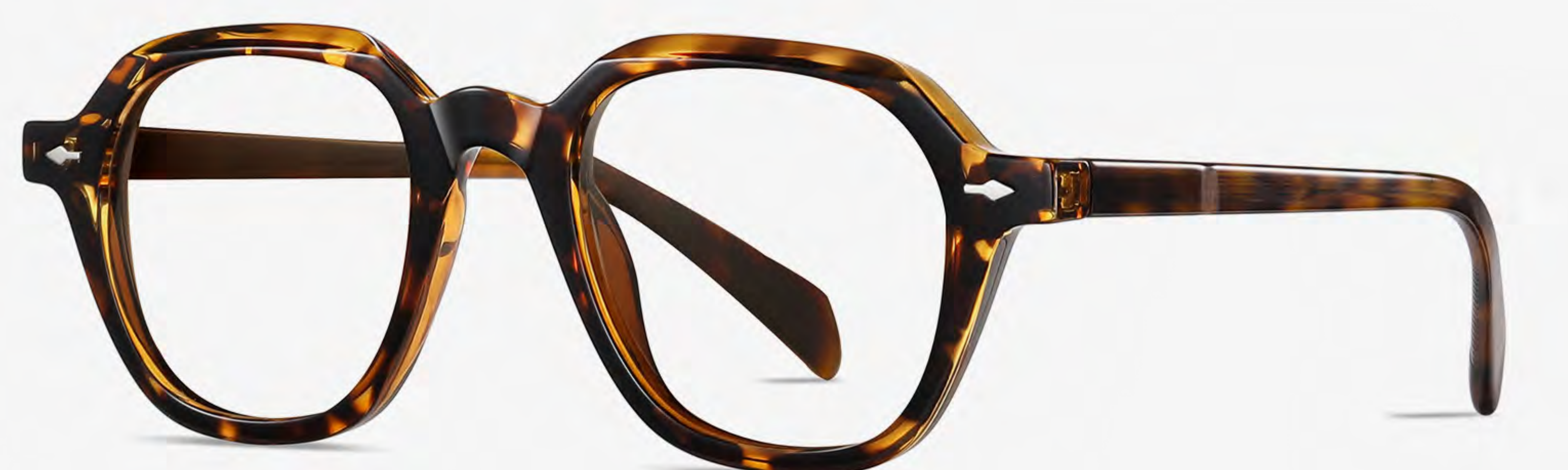
N0.6 Demi Floral C2-1 (Anti blue light)