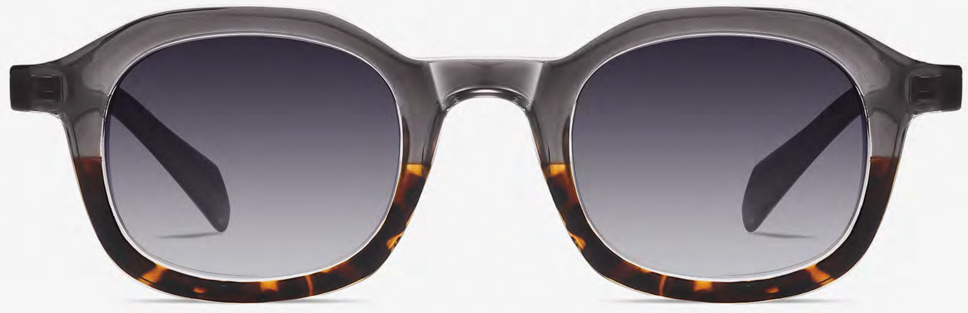
^ S31104 Size : 46-25-147