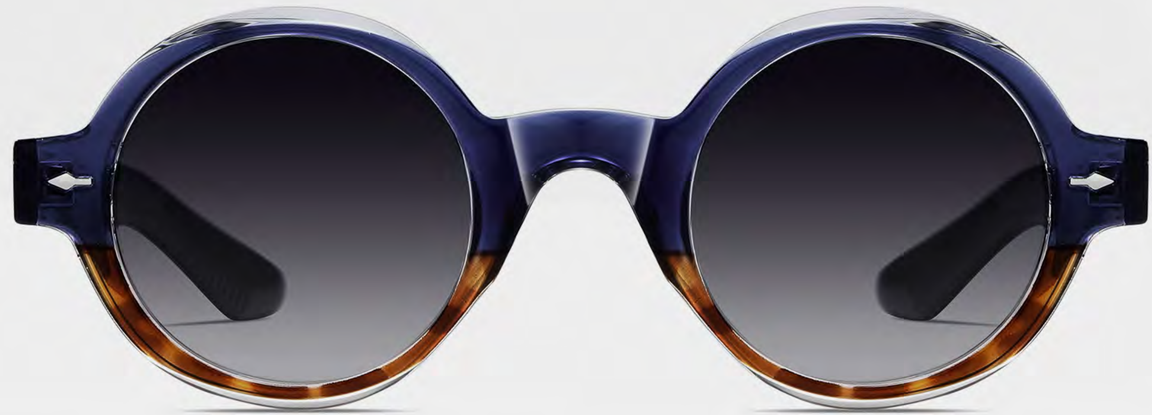
^ S31108 Size : 47-28-148