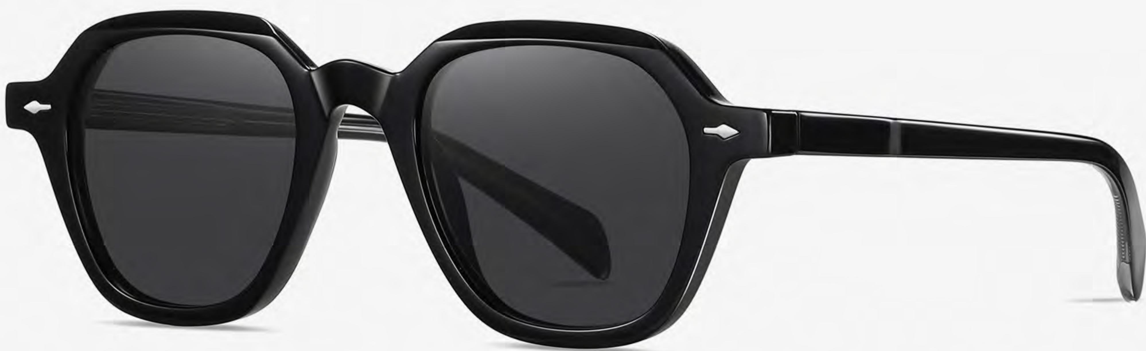
N0.1 Bright Black Grey C1 (1.1polarized light)