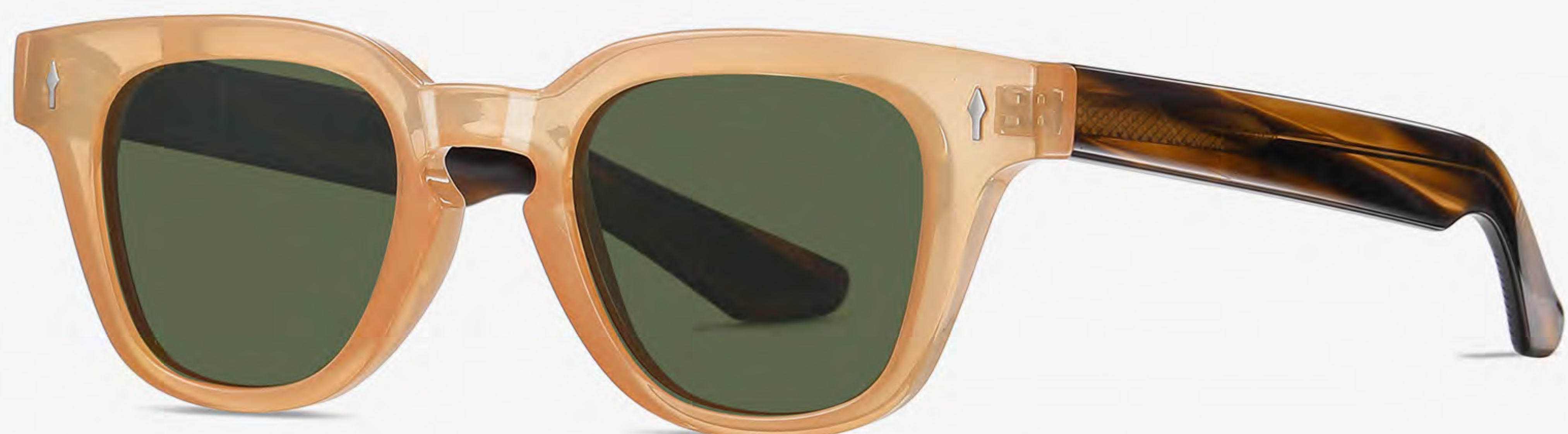
N0.3 Bright Orange Green C3 (1.1polarized light)