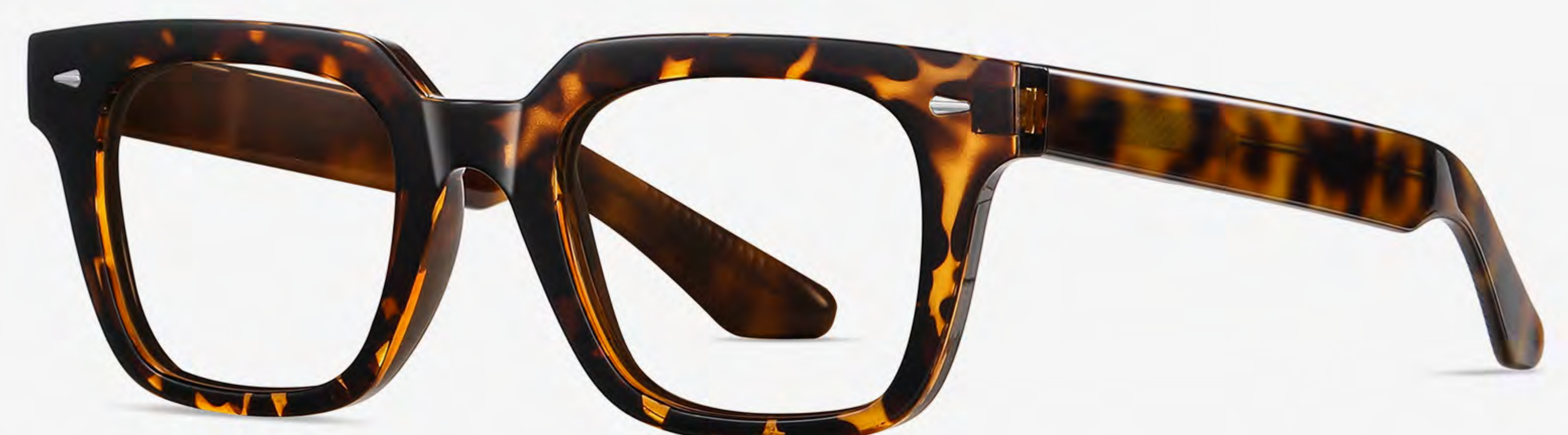
N0.7 Bright Tortoiseshell C3-1 (Anti blue light)