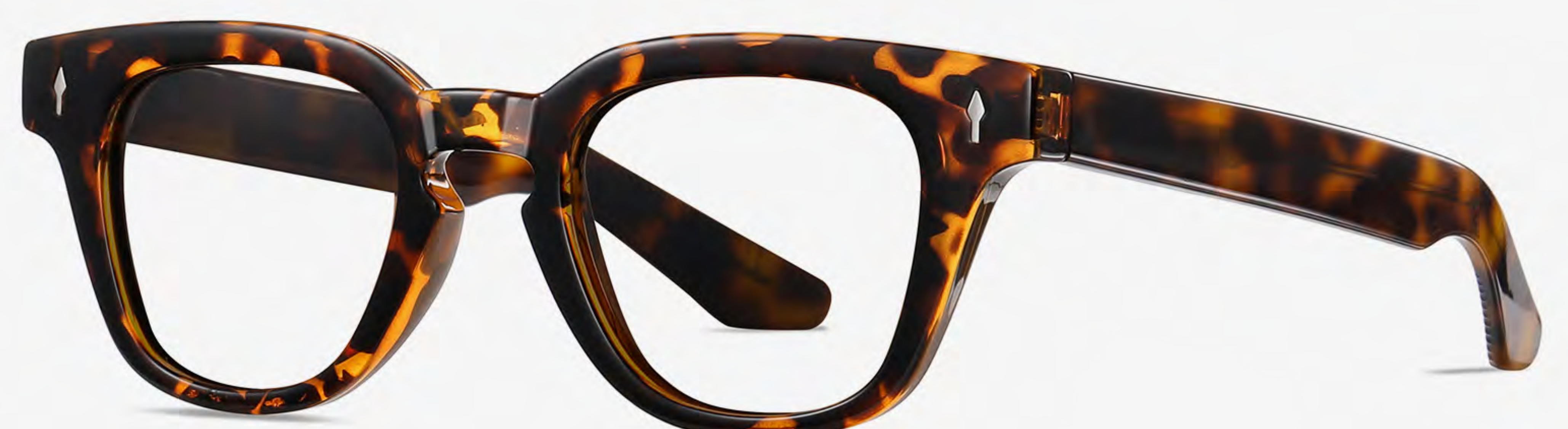
N0.6 Demi Floral C2-1 (Anti blue light)