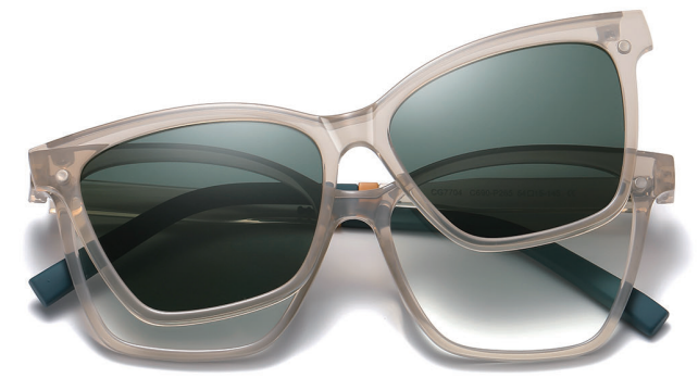
N0.3 Bright Creamy Green C690-P265