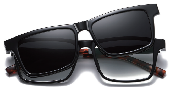
N0.1 Bright Black Gradient Grey C01-P120