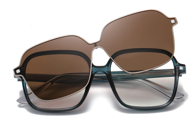
N0.2 Transparent Green / Gold Tea C636-P75