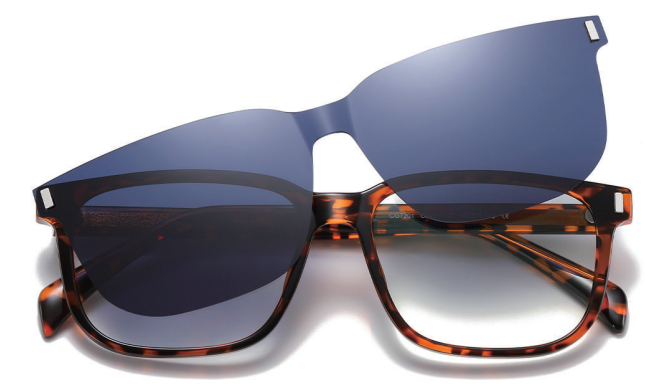
N0.2 Demi Floral C645-P137