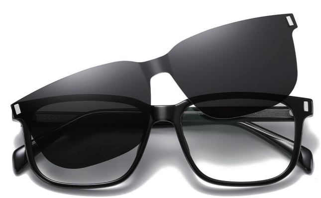
N0.1 Bright Black C01-P109