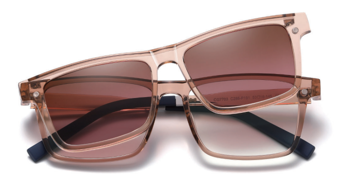
N0.4 Bright Tea Gradient Tea C286-P191

N0.5 Bright Transparent Gradient Grey C26-P120