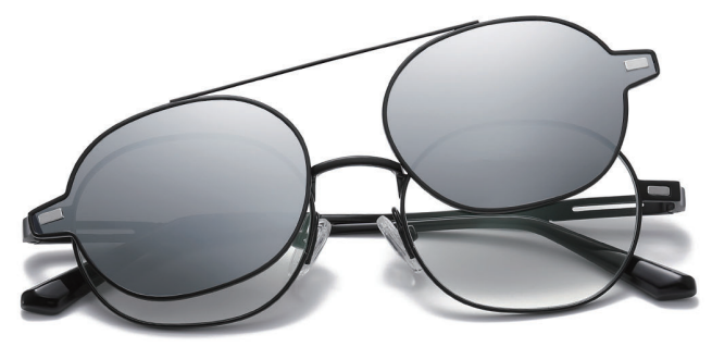
N0.4 Black White Silver C91-P08