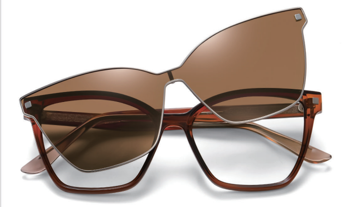
N0.3 Bright Tea / Silver Tea C642-P75