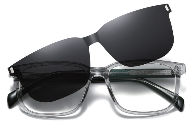
N0.4 Transparent Light Grey C644-P109