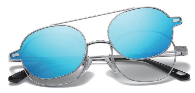
N0.5 Silver Blue coated C05-P06