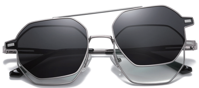
N0.1 Bright Light Gun Grey C07-P109