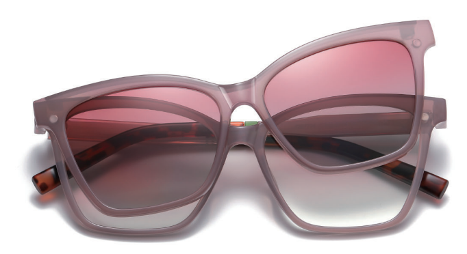
N0.4 Bright Coffee Gradient Pink C743-P199