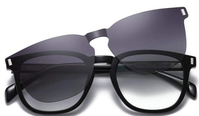
N0.1 Bright Black / Gradient Grey C01-P115