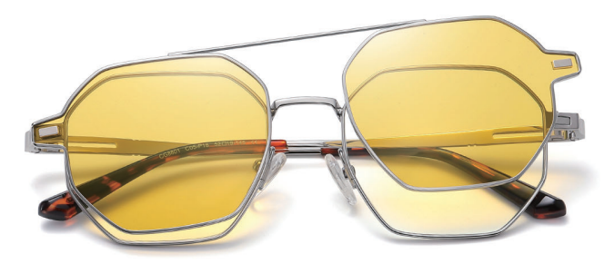
N0.4 Bright Silver Yellow C05-P18