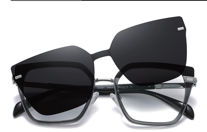
N0.1 Black - Transparent Grey / Grey C650-P01