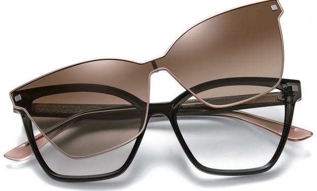
N0.5 Bright Green / Gold Tea C641-P116