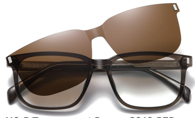
N0.5 Transparent Brown C646-P75