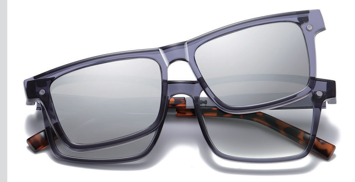
N0.3 Bright Grey Silver C541-P194