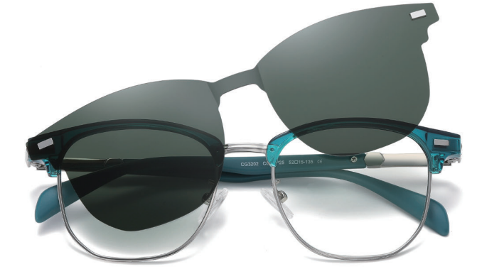
N0.3 Bright Green Silver / Green C658-P25