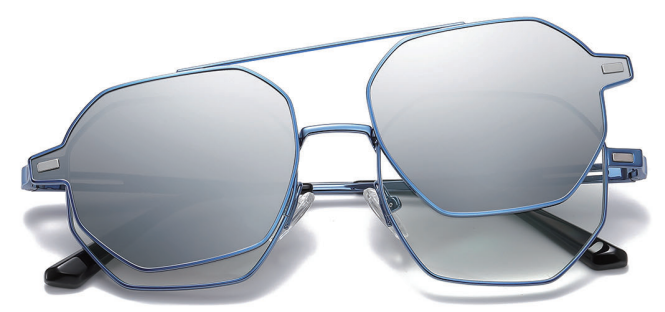
N0.3 Bright Blue White Silver C12-P08