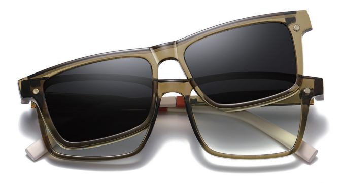
N0.2 Bright Green Grey C526-P97