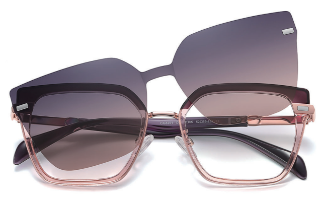
N0.5 Purple - Pink / Purple - Pink C654-P105

N0.3 Transparent Grey - Pink / Grey C652-P125