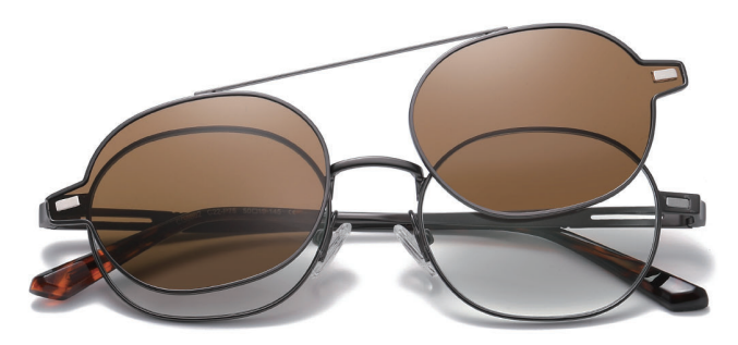
N0.2 Deep Gun Tea C22-P75