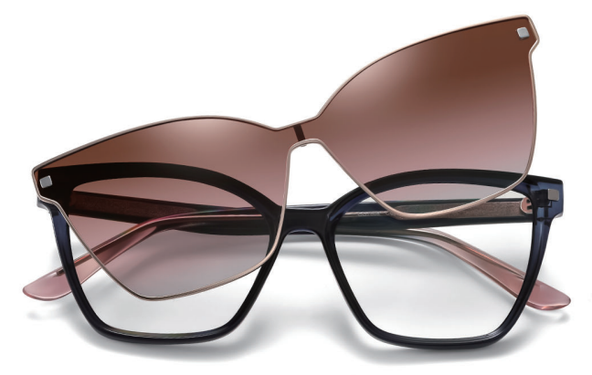
N0.2 Bright Tea / Gold Tea C639-P127