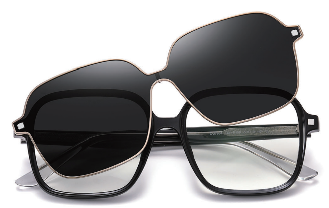
N0.1 Bright Black / Gold Grey C01-P109