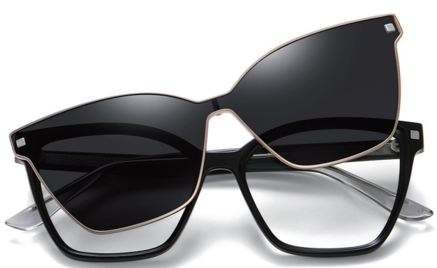
N0.1 Bright Black / Gold Grey C01-P109