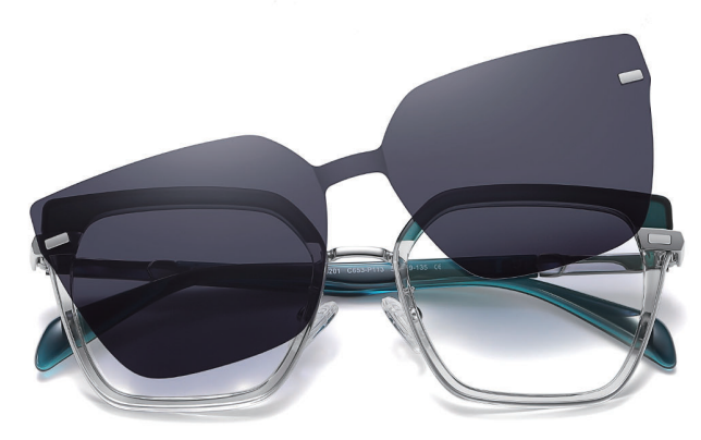
N0.4 Blue Green - Light Yellow / Blue Grey C653-P113