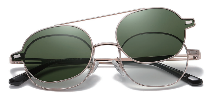
N0.3 Gold Green C06-P96