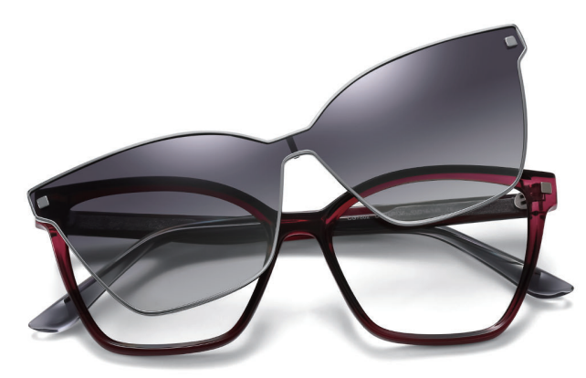
N0.4 Bright Purple / Silver Grey C640-P115