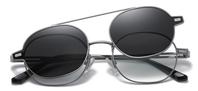
N0.1 Light Gun Grey C07-P109