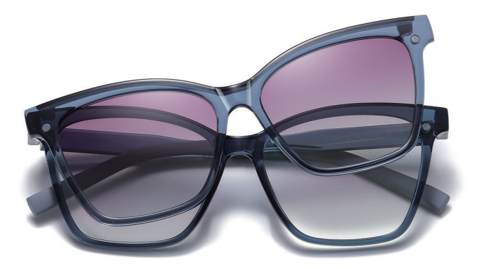
N0.1 Bright Black Gradient Grey C01-P120 N0.2 Bright Blue Gradient Purple C344-P190