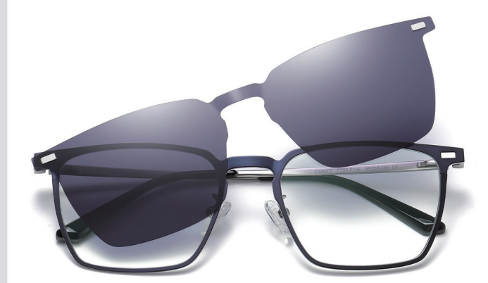
N0.3 Matte Silver Blue / Blue Grey C209-P196