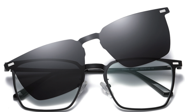
N0.1 Matte Black / GreyC91-P01